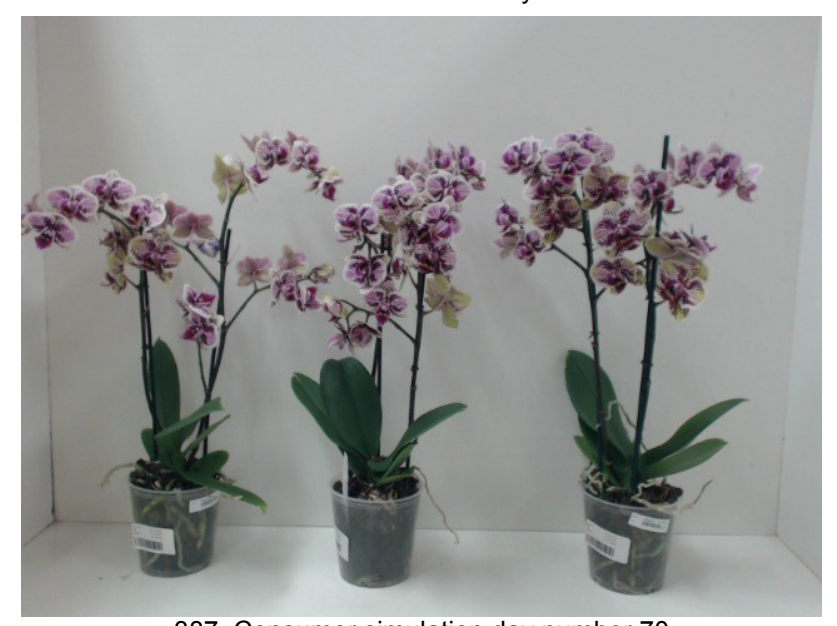
387. Consumer simulation day number 70