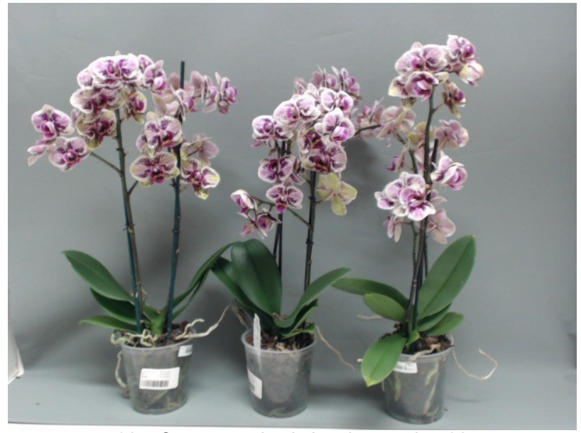
387. Consumer simulation day number 92