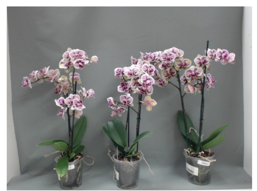
387. Consumer simulation day number 141