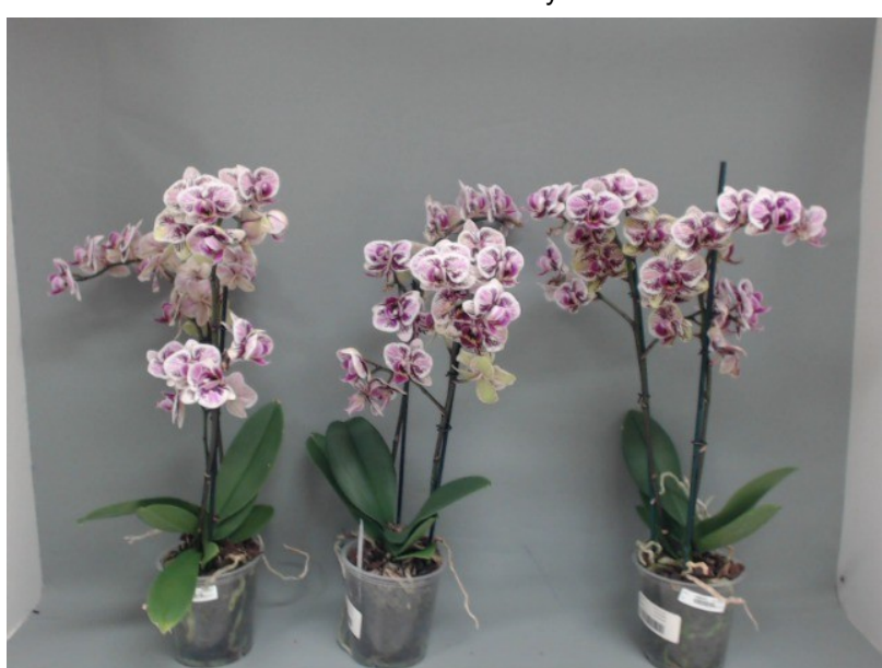
387. Consumer simulation day number 127