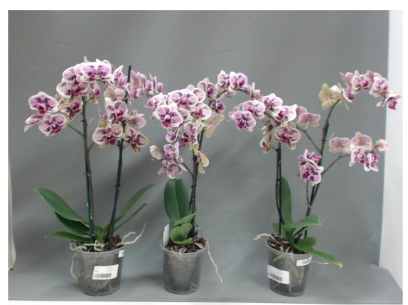
387. Consumer simulation day number 99