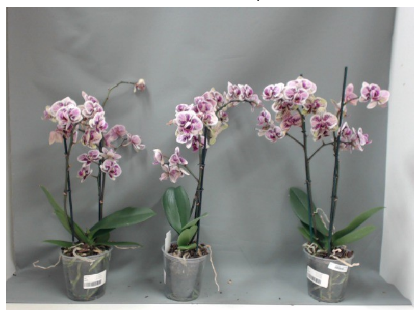
387. Consumer simulation day number 155