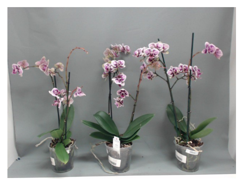
387. Consumer simulation day number 162