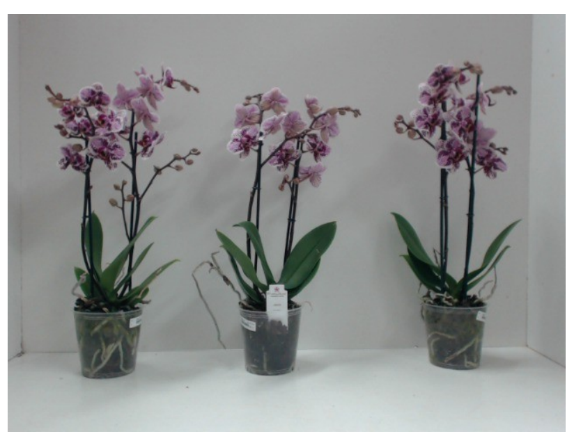
387. Consumer simulation day number 0