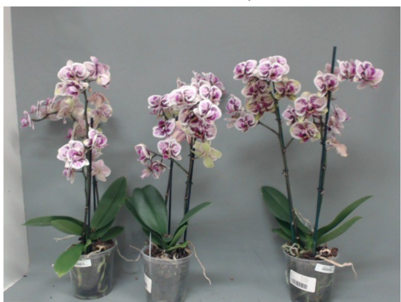
387. Consumer simulation day number 134