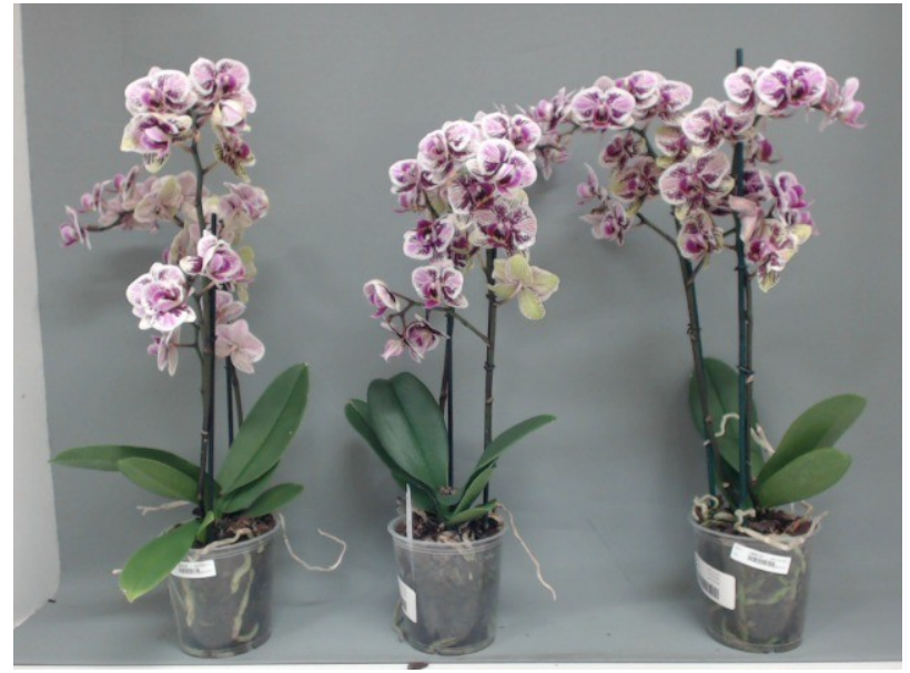
387. Consumer simulation day number 113