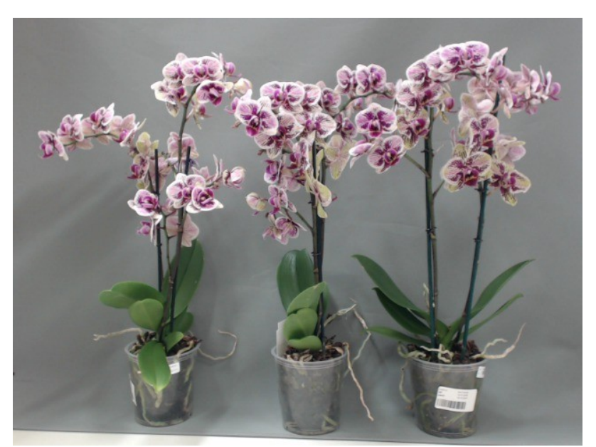
387. Consumer simulation day number 78