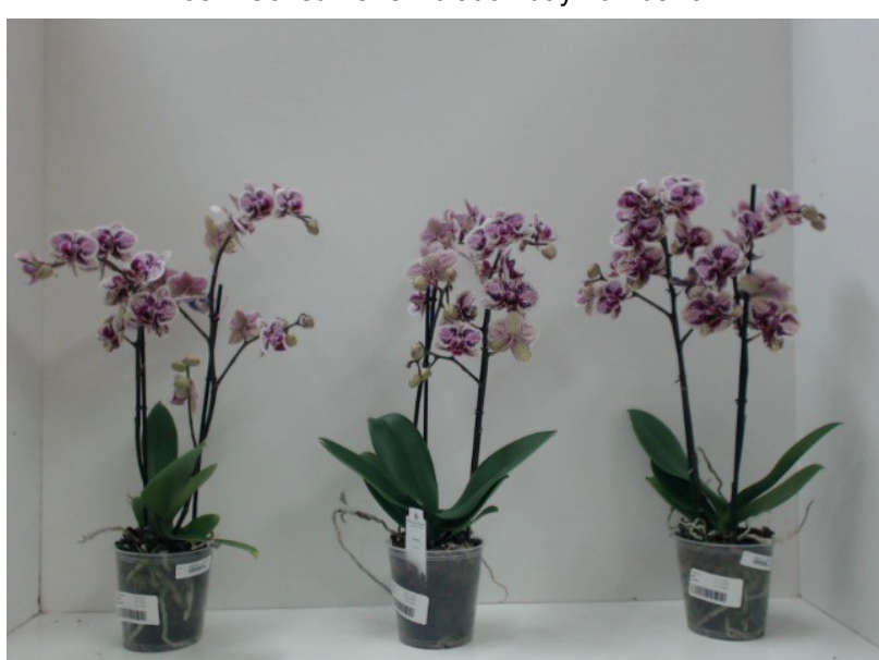
387. Consumer simulation day number 35