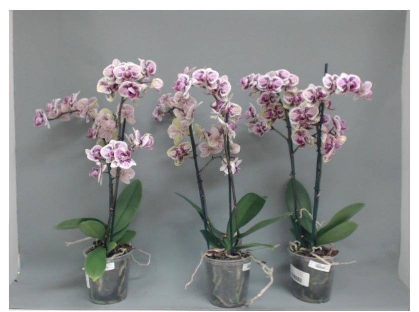
387. Consumer simulation day number 120