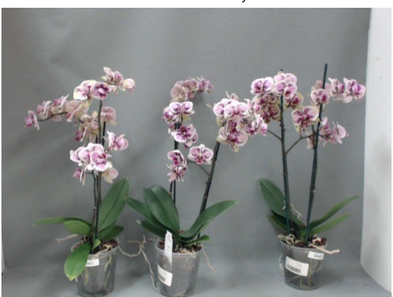
387. Consumer simulation day number 148