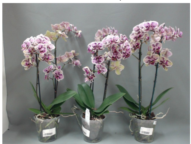
387. Consumer simulation day number 85