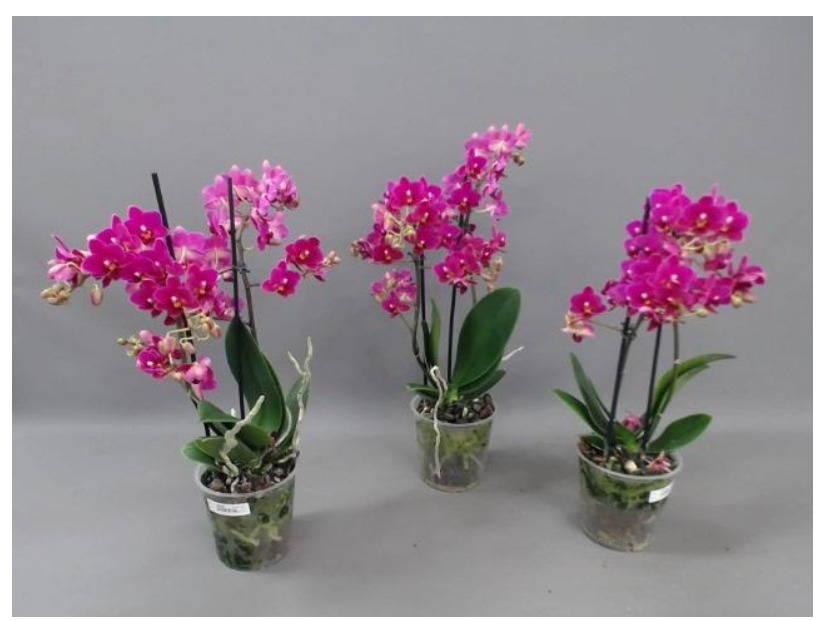
663. Consumer simulation day number 0