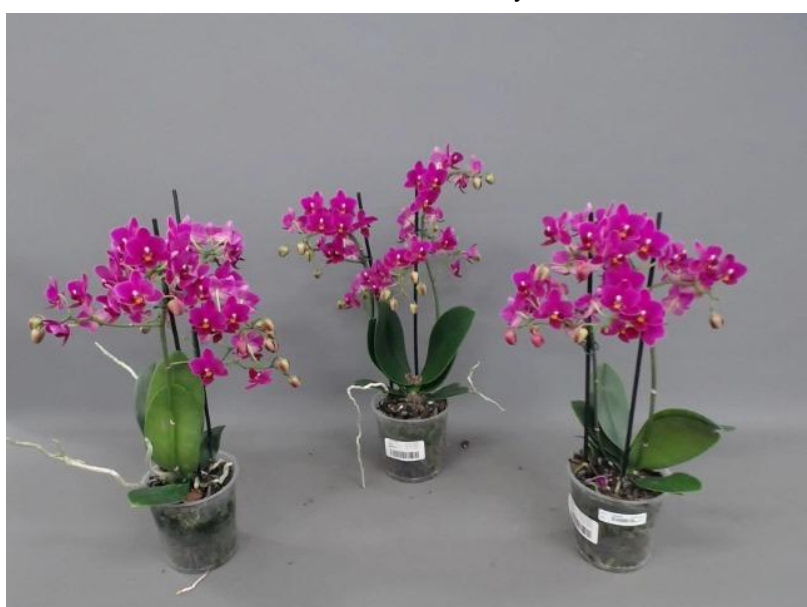
663. Consumer simulation day number 35