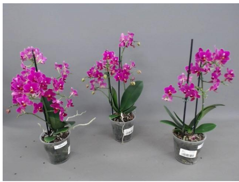
663. Consumer simulation day number 70