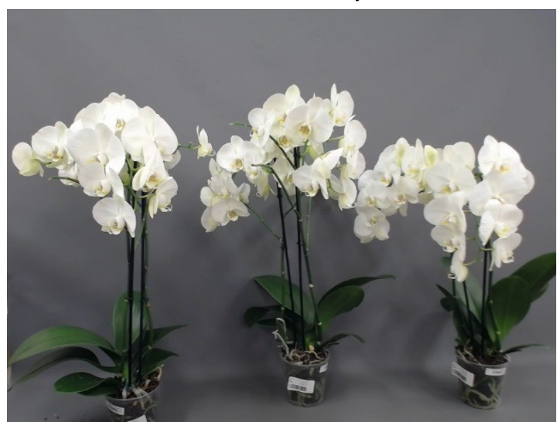
620. Consumer simulation day number 35