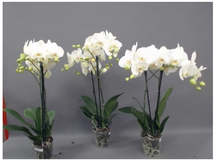
620. Consumer simulation day number 0