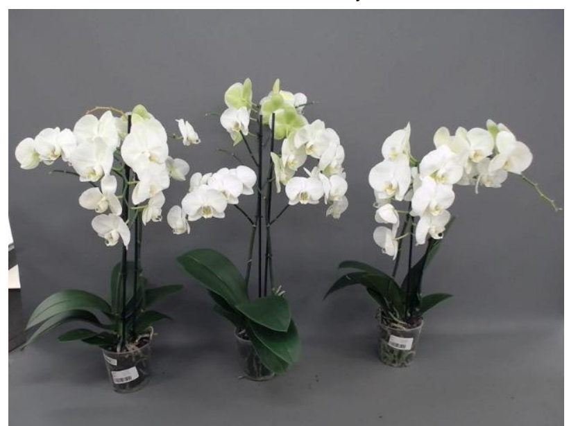
620. Consumer simulation day number 105