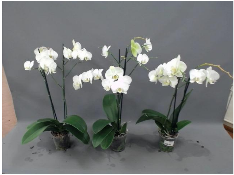
620. Consumer simulation day number 112