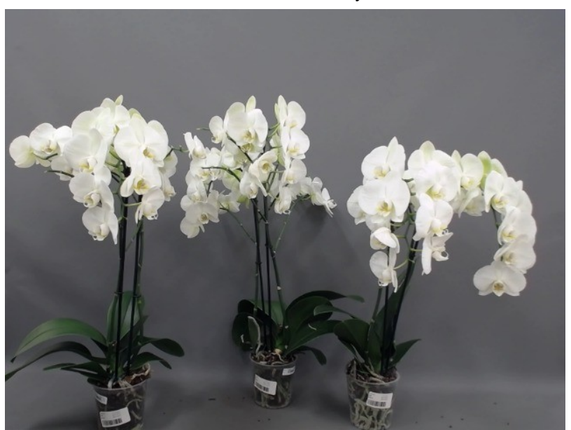
620. Consumer simulation day number 84