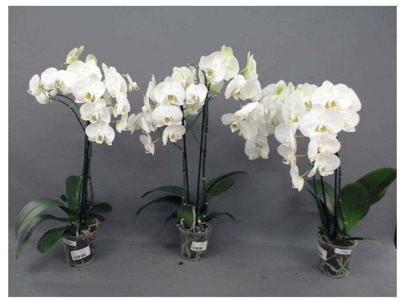
620. Consumer simulation day number 98