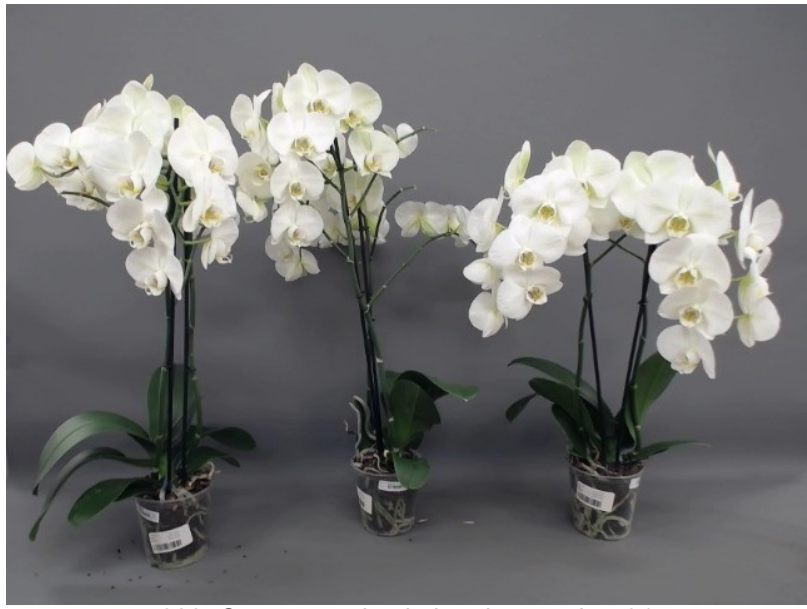
620. Consumer simulation day number 91