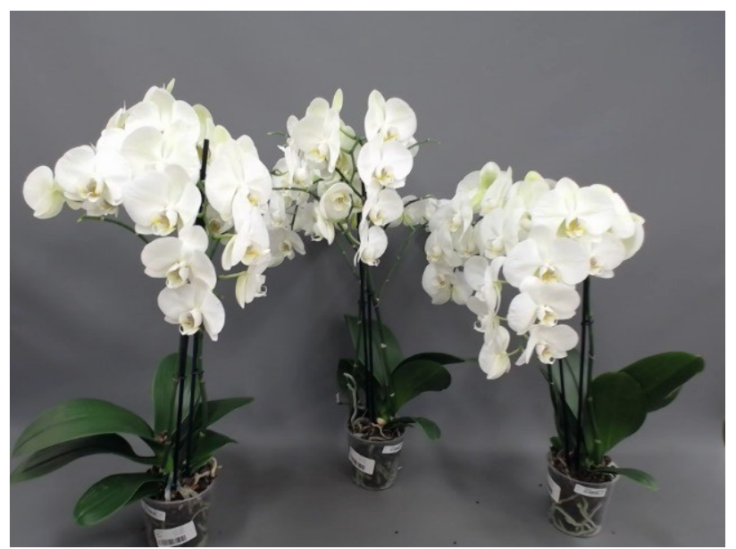
620. Consumer simulation day number 77