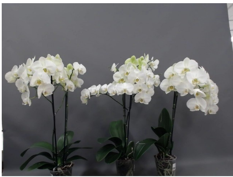
620. Consumer simulation day number 70