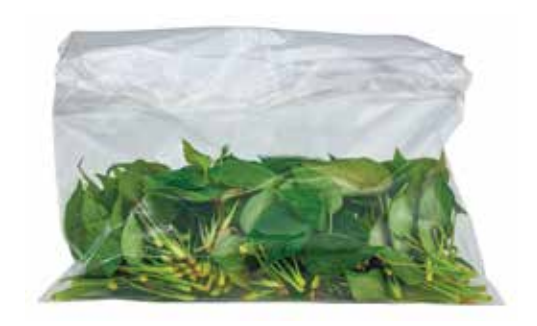
Unrooted cutting packing