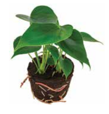
Plug from 28 cells tray