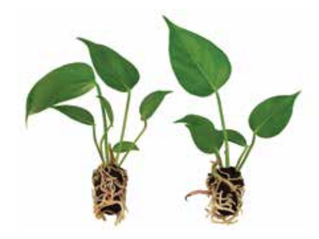
Plug from 180 cells tray