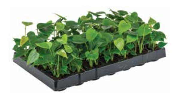
28 cells tray