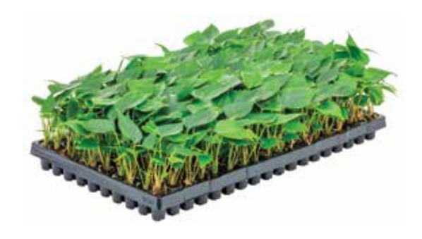
180 cells tray