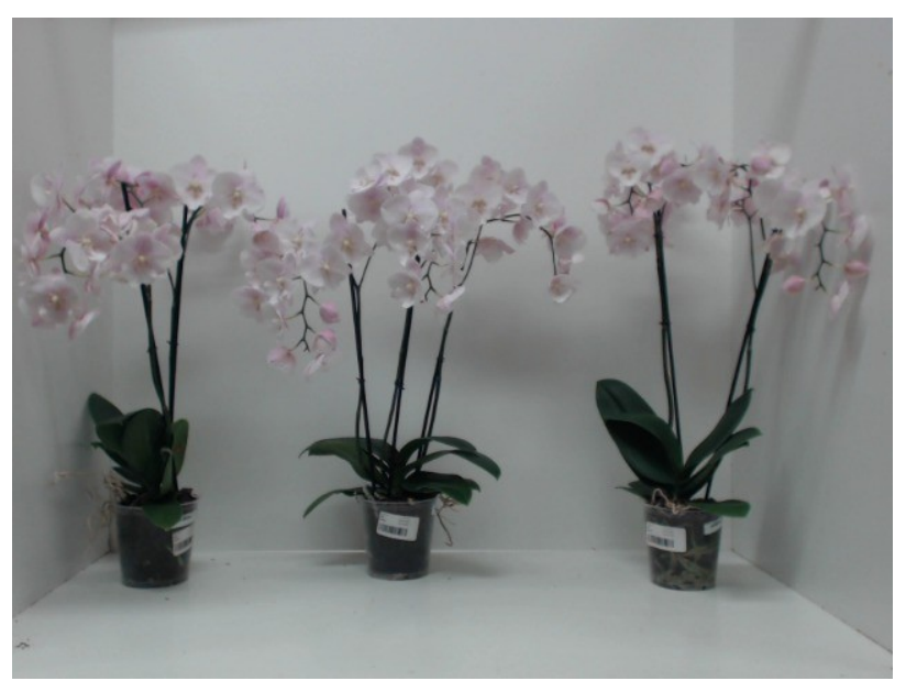
360. Consumer simulation day number 119