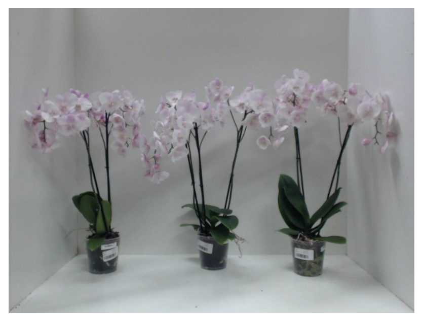
360. Consumer simulation day number 77