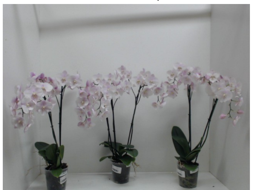
360. Consumer simulation day number 105