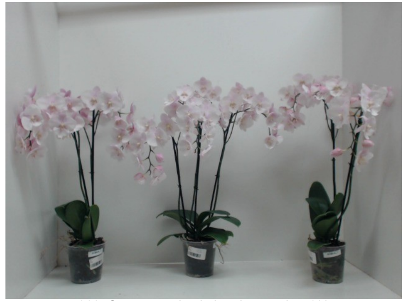
360. Consumer simulation day number 112