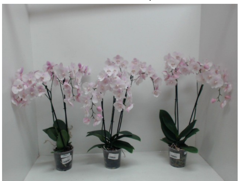
360. Consumer simulation day number 84