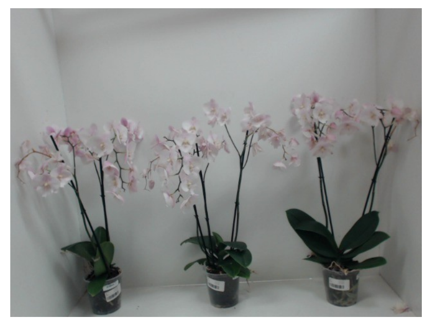
360. Consumer simulation day number 141