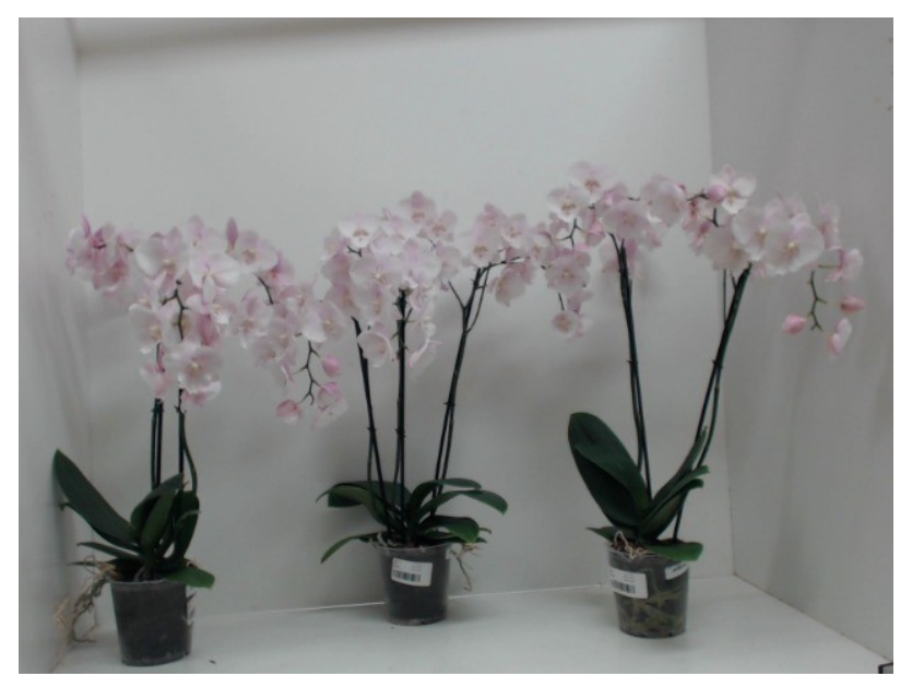
360. Consumer simulation day number 98