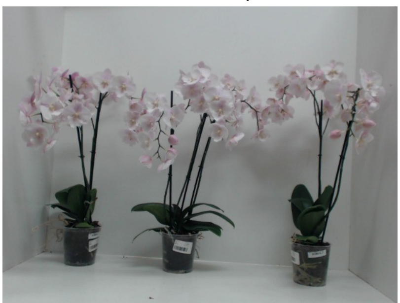
360. Consumer simulation day number 127