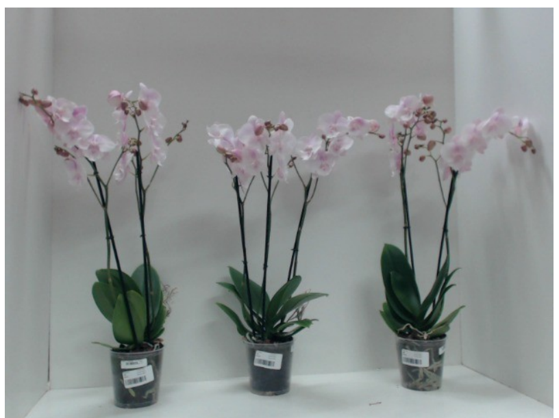
360. Consumer simulation day number 0