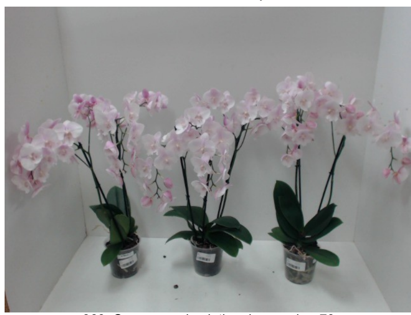
360. Consumer simulation day number 70