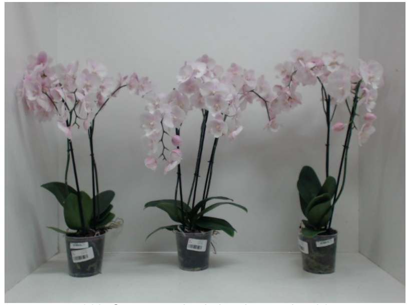
360. Consumer simulation day number 91