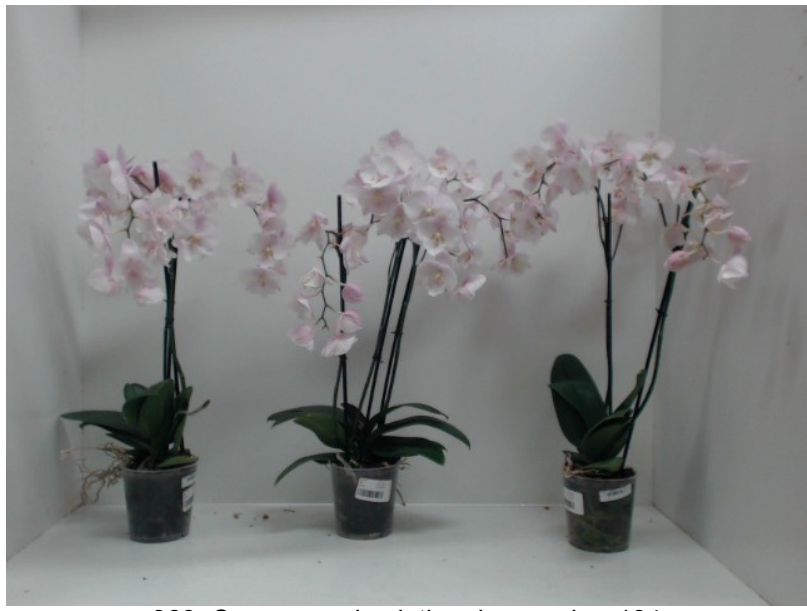
360. Consumer simulation day number 134