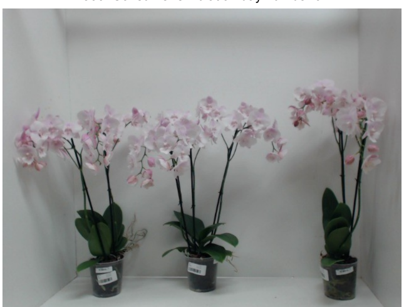
360. Consumer simulation day number 35