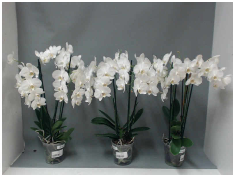
416. Consumer simulation day number 70