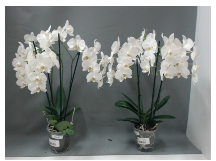
416. Consumer simulation day number 77