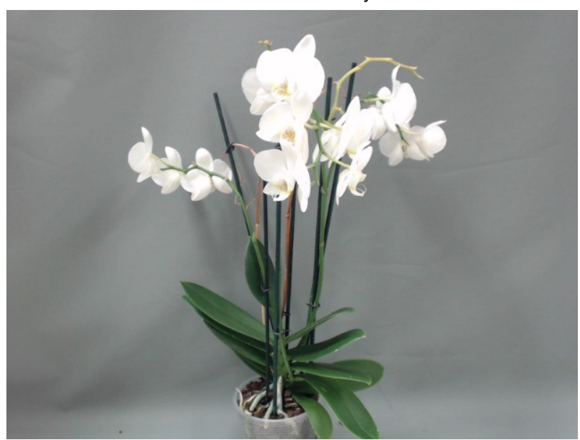
416. Consumer simulation day number 77