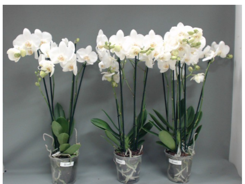
416. Consumer simulation day number 0