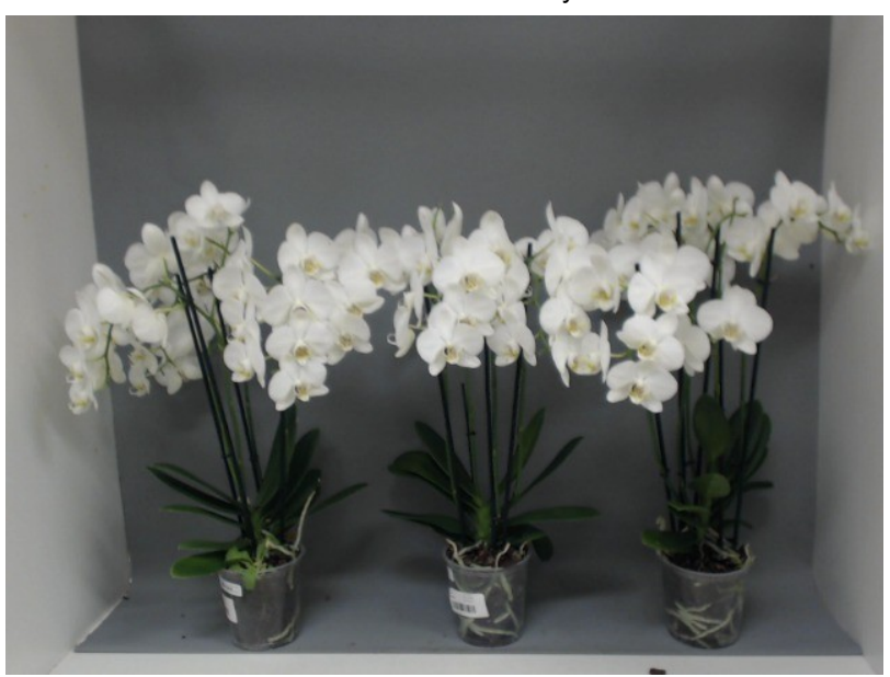
416. Consumer simulation day number 35