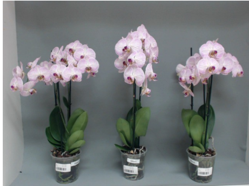
400. Consumer simulation day number 35