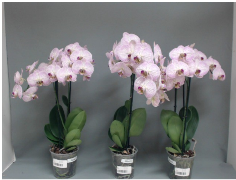
400. Consumer simulation day number 70