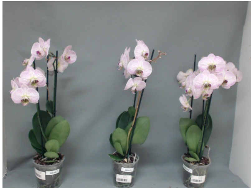
400. Consumer simulation day number 134