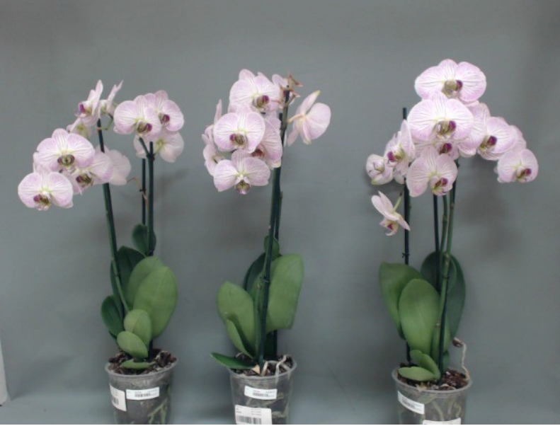
400. Consumer simulation day number 127