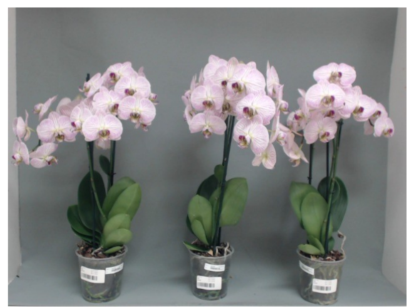
400. Consumer simulation day number 99