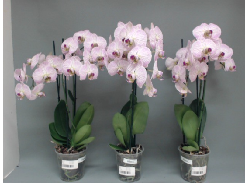
400. Consumer simulation day number 92