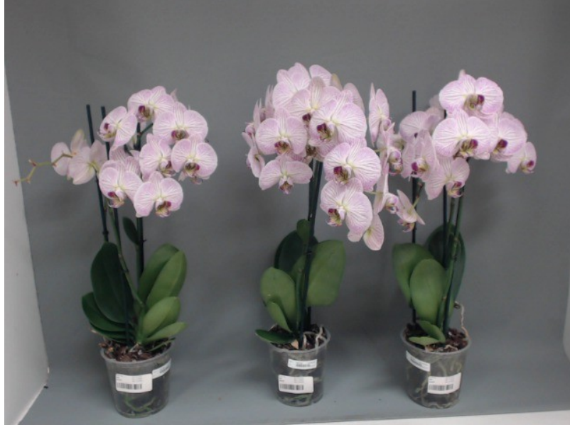
400. Consumer simulation day number 106