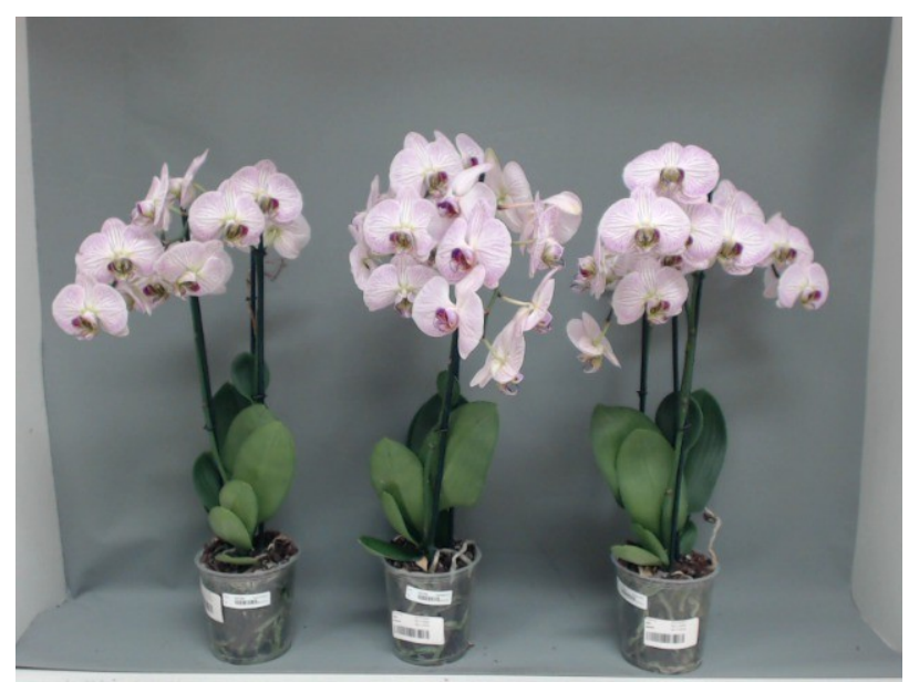
400. Consumer simulation day number 120