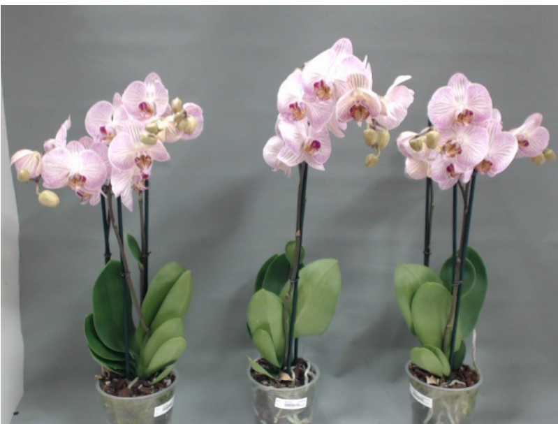
400. Consumer simulation day number 0