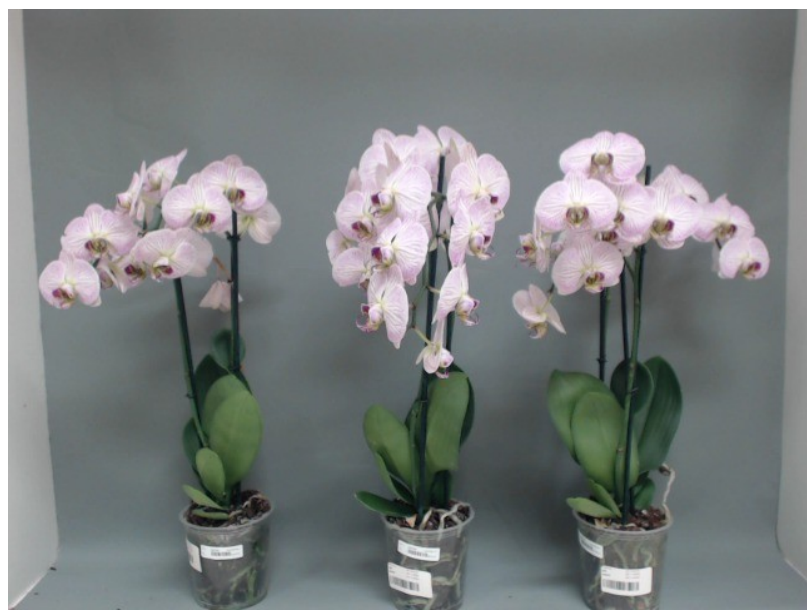
400. Consumer simulation day number 113