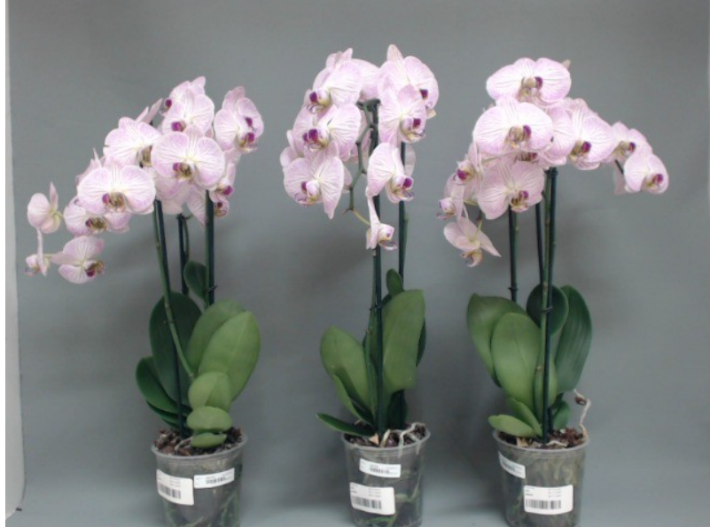
400. Consumer simulation day number 85