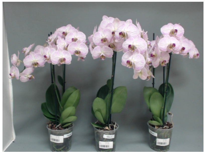
400. Consumer simulation day number 78