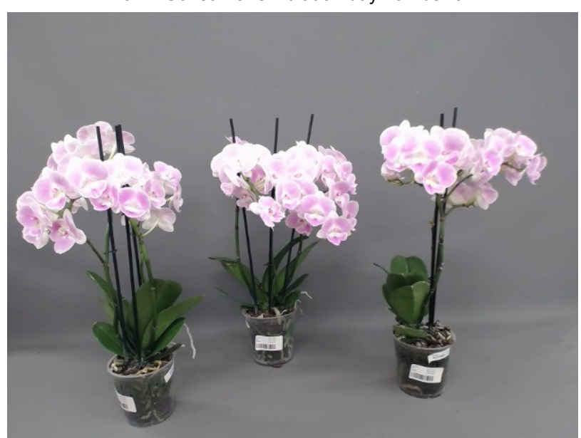
641. Consumer simulation day number 35