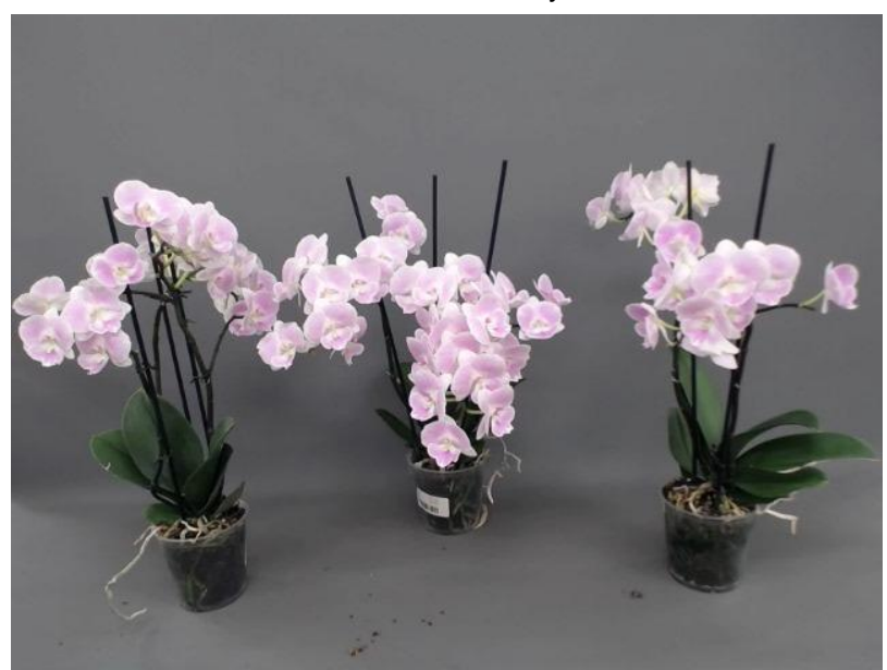
641. Consumer simulation day number 126