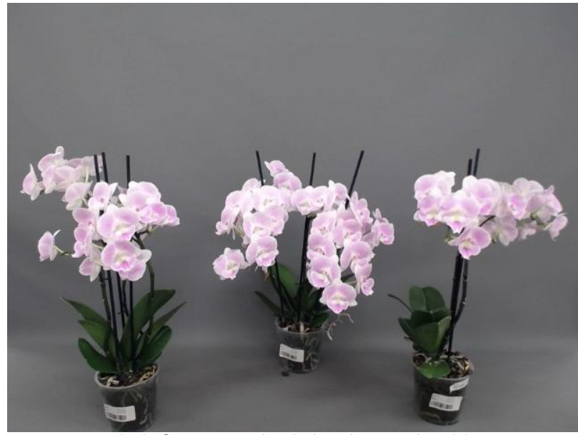
641. Consumer simulation day number 91