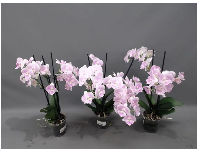
641. Consumer simulation day number 105