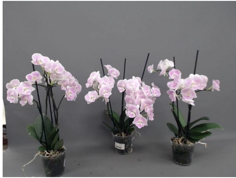
641. Consumer simulation day number 133