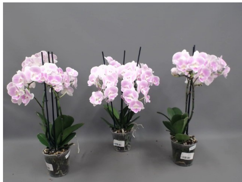
641. Consumer simulation day number 70