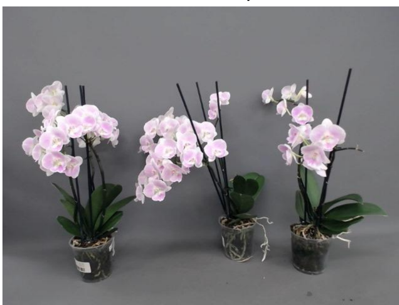
641. Consumer simulation day number 147