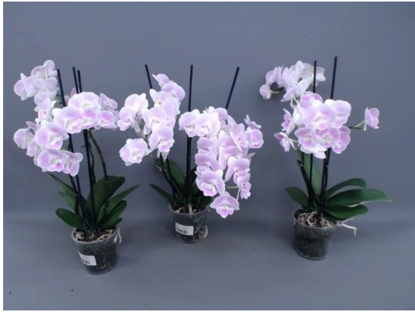
641. Consumer simulation day number 112