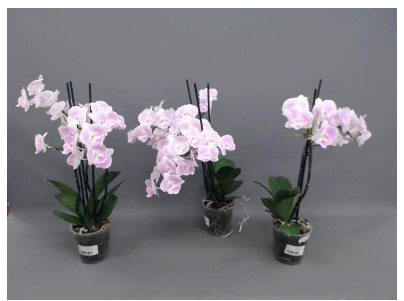
641. Consumer simulation day number 119