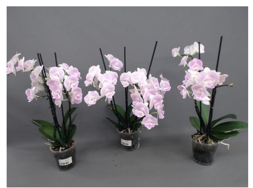
641. Consumer simulation day number 140