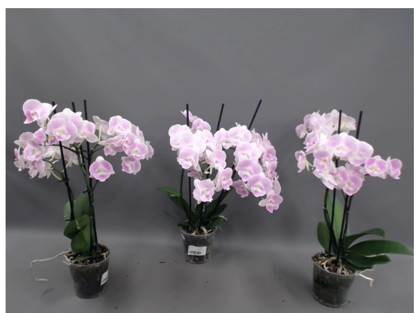
641. Consumer simulation day number 77