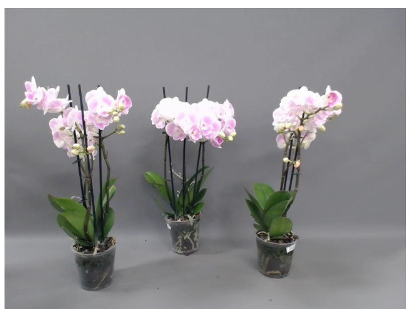
641. Consumer simulation day number 0