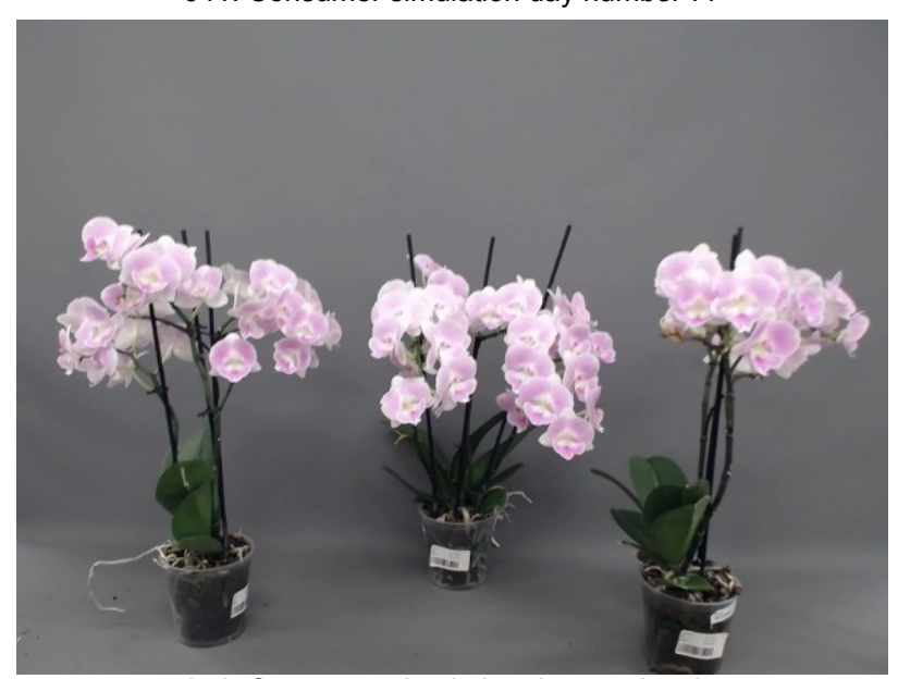
641. Consumer simulation day number 84