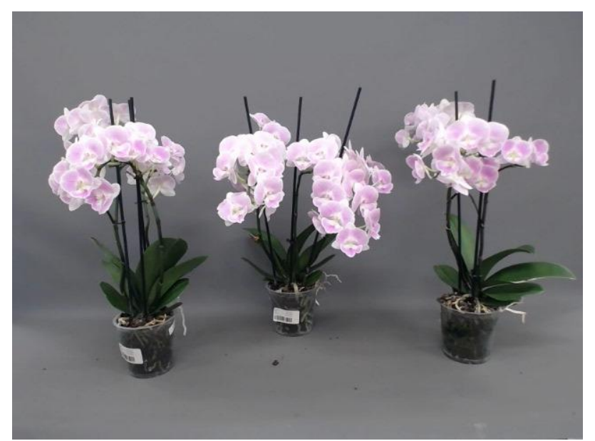
641. Consumer simulation day number 98