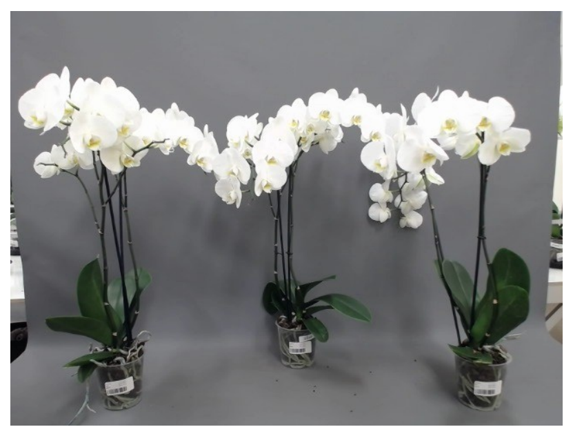
614. Consumer simulation day number 77