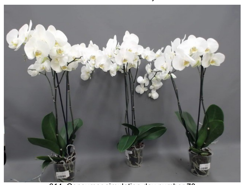
614. Consumer simulation day number 70