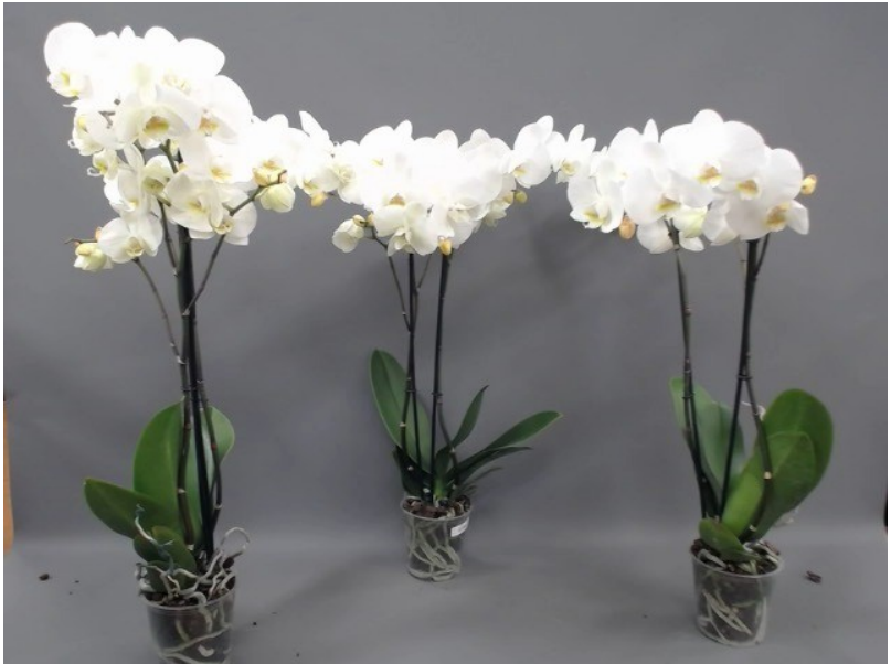
614. Consumer simulation day number 0