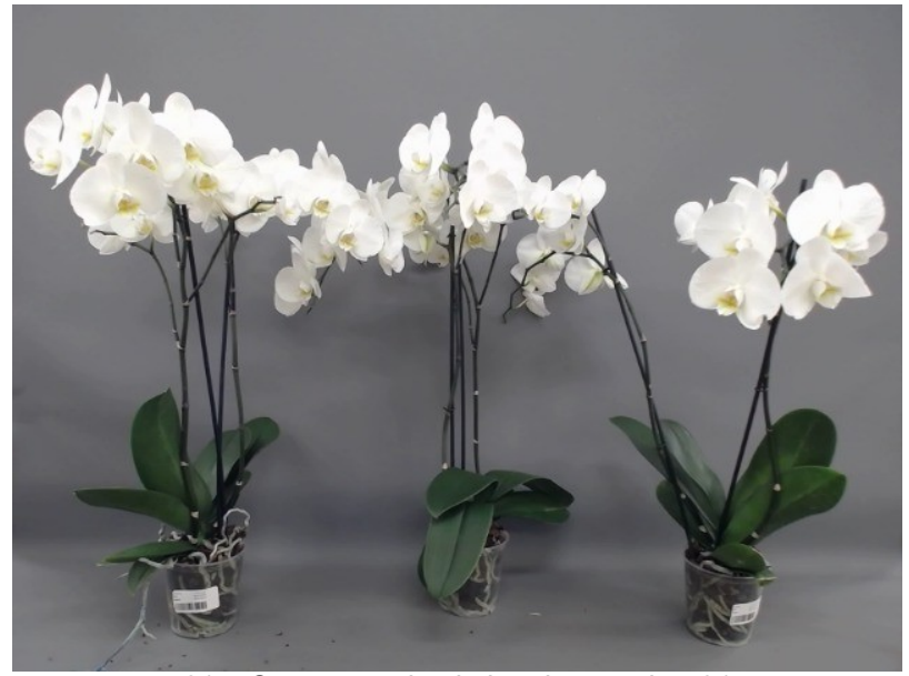
614. Consumer simulation day number 91