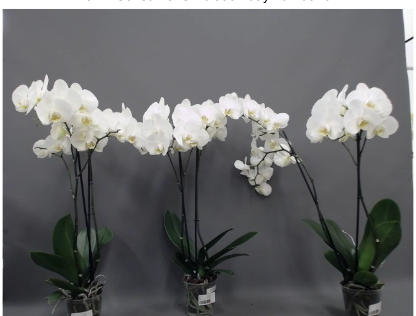
614. Consumer simulation day number 35