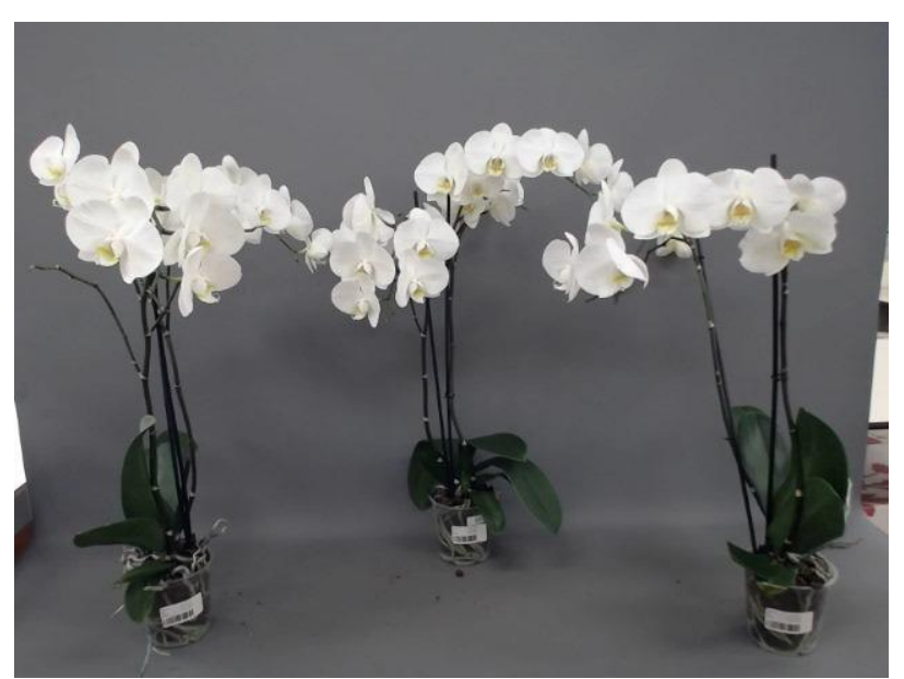
614. Consumer simulation day number 98