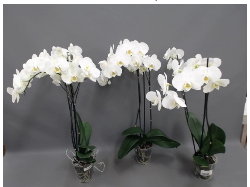
614. Consumer simulation day number 84