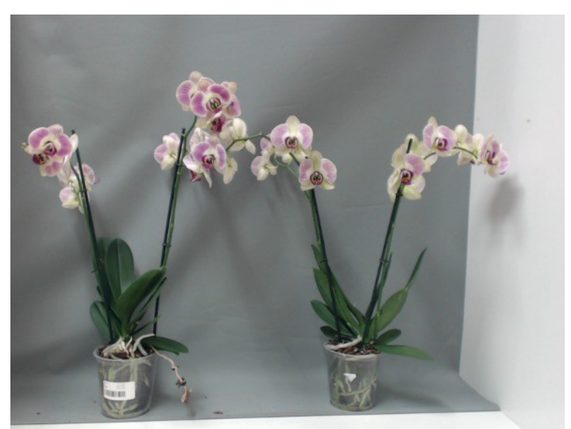
417. Consumer simulation day number 91