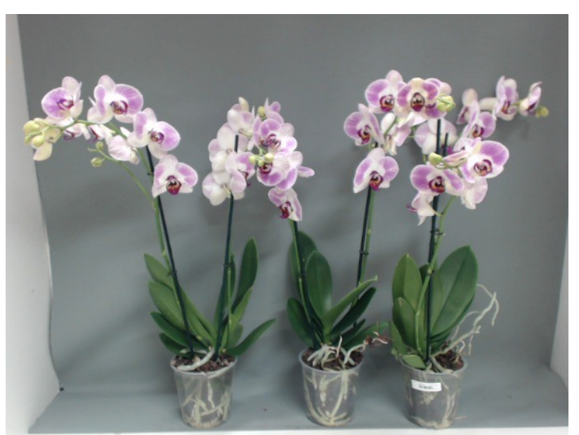
417. Consumer simulation day number 0