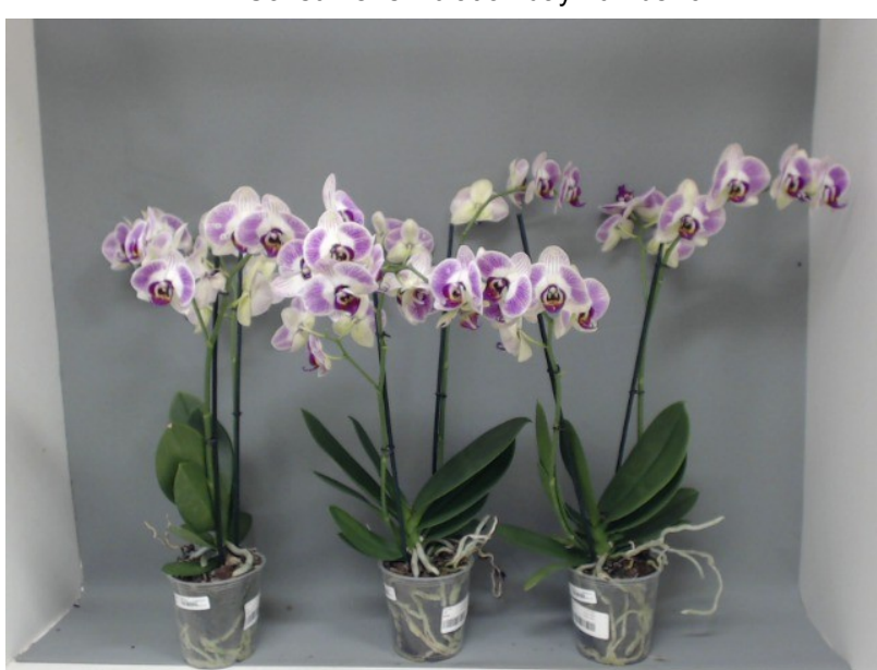
417. Consumer simulation day number 35