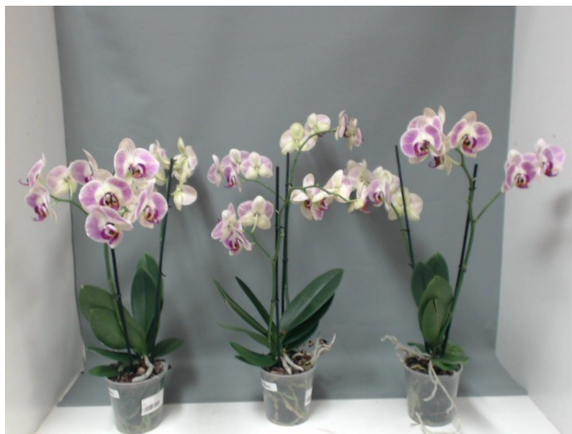
417. Consumer simulation day number 70