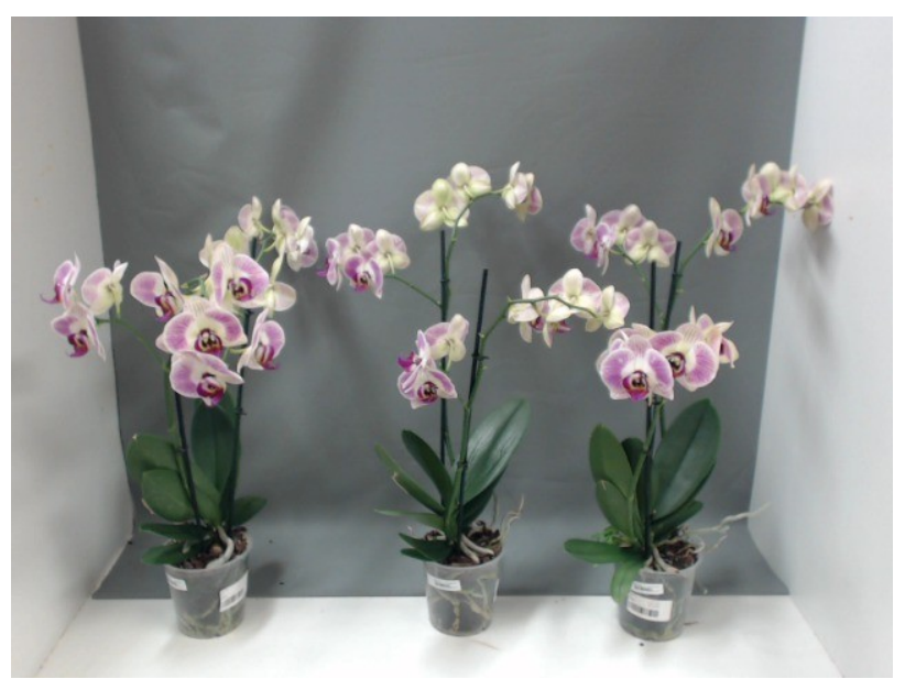
417. Consumer simulation day number 77