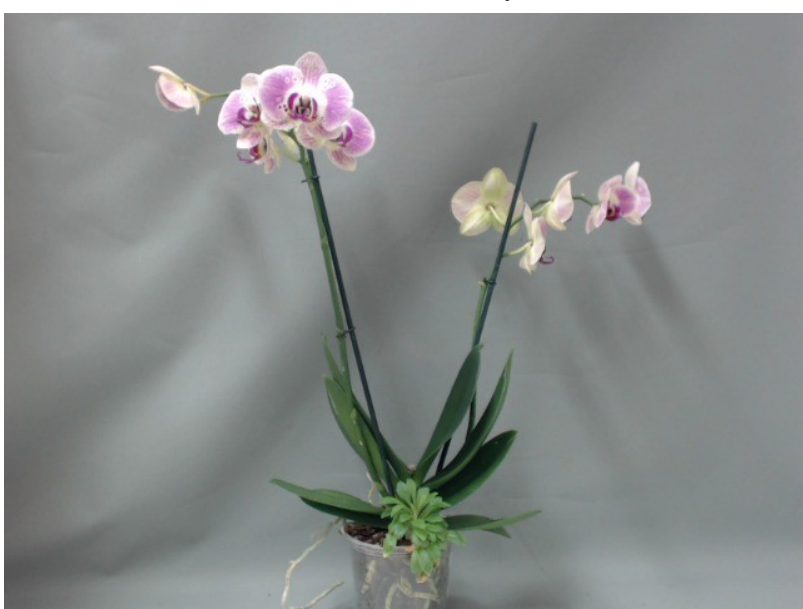
417. Consumer simulation day number 91