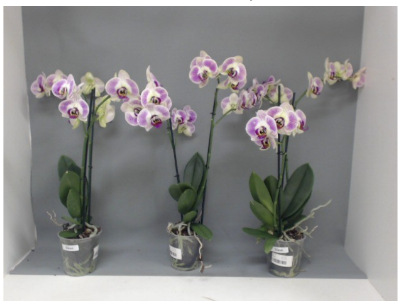
417. Consumer simulation day number 84