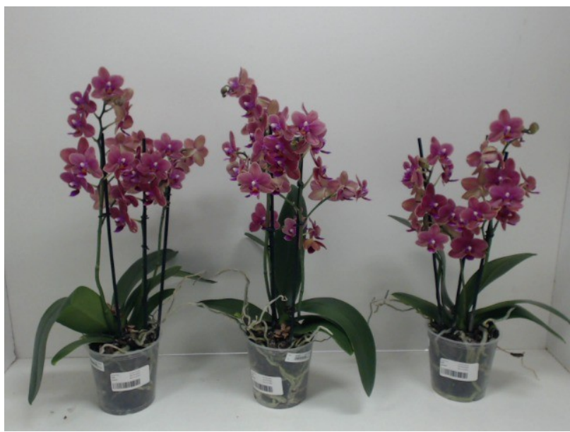
382. Consumer simulation day number 70