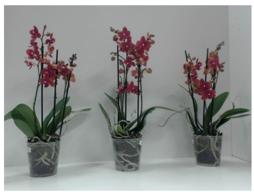
382. Consumer simulation day number 0