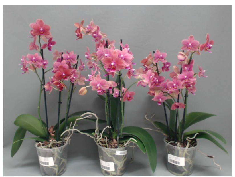
382. Consumer simulation day number 98