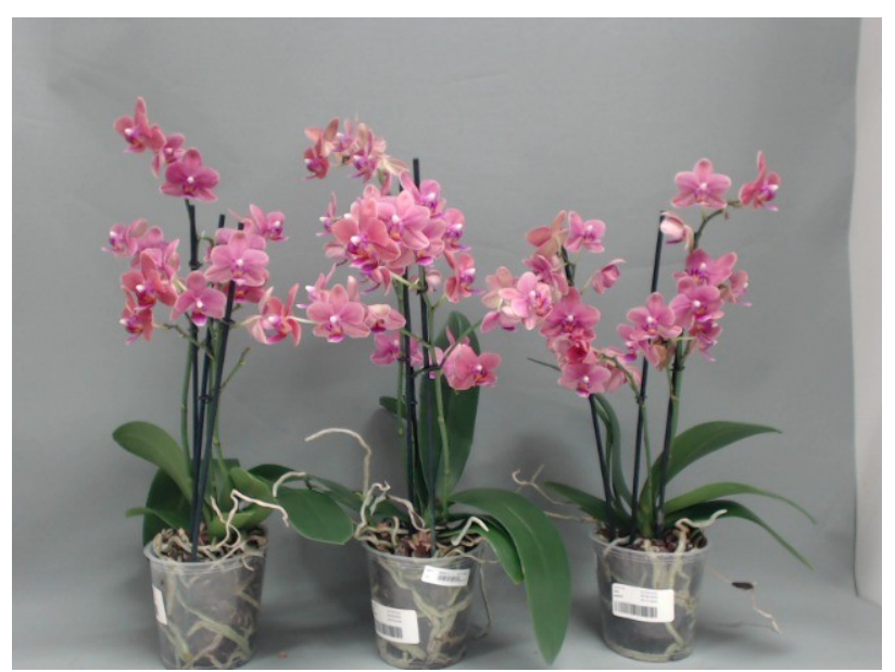
382. Consumer simulation day number 119