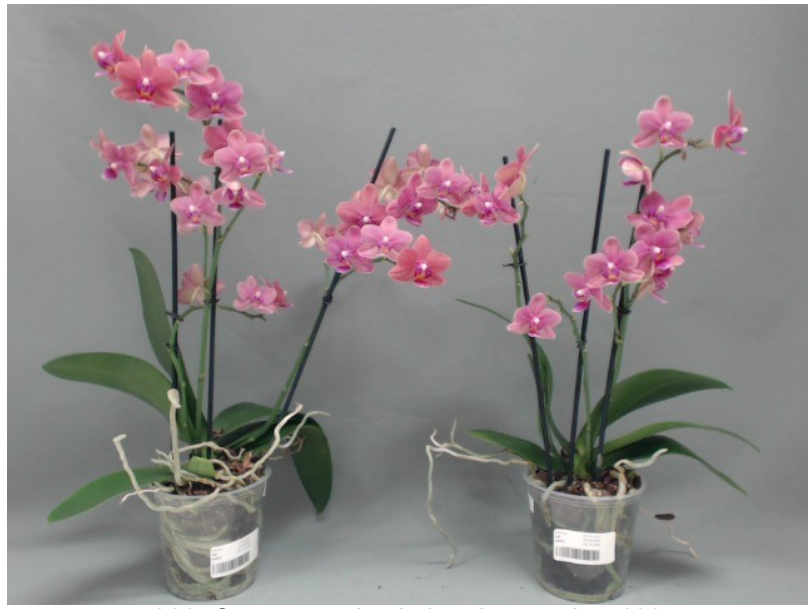
382. Consumer simulation day number 126