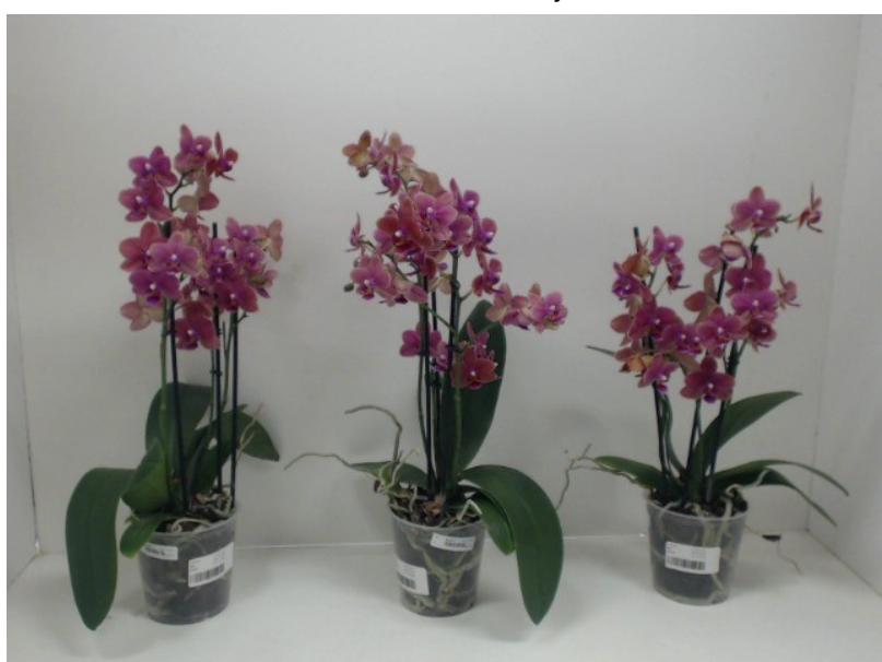
382. Consumer simulation day number 84