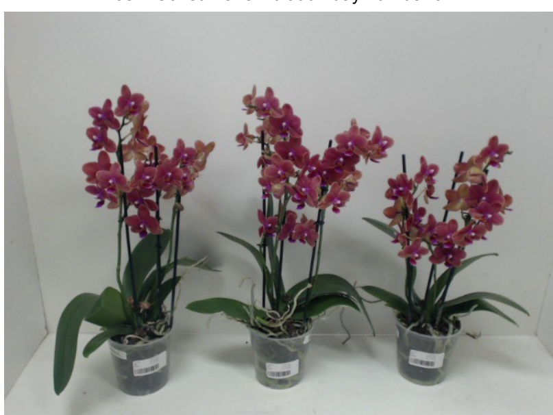
382. Consumer simulation day number 35