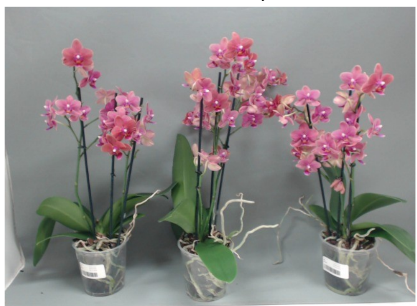
382. Consumer simulation day number 105