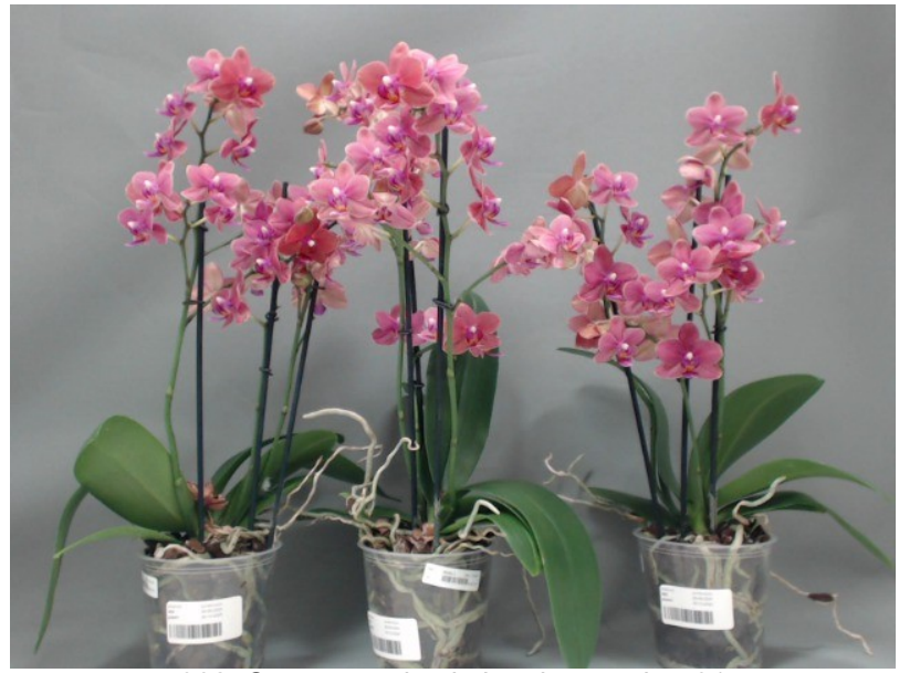
382. Consumer simulation day number 91