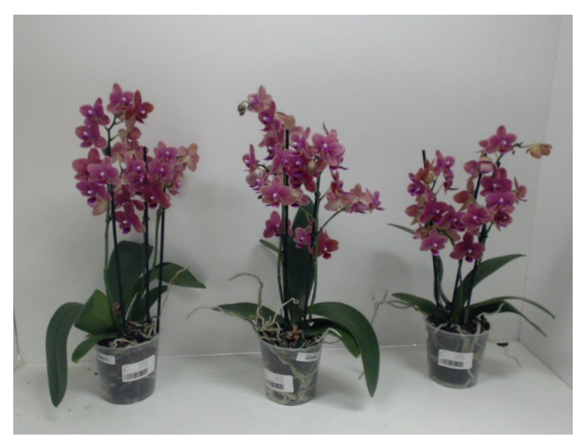
382. Consumer simulation day number 77