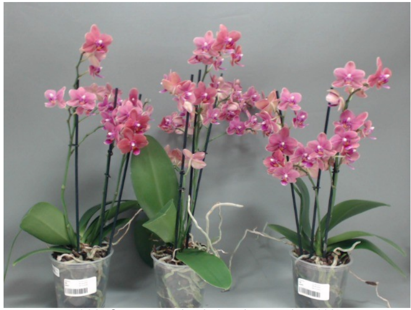
382. Consumer simulation day number 112