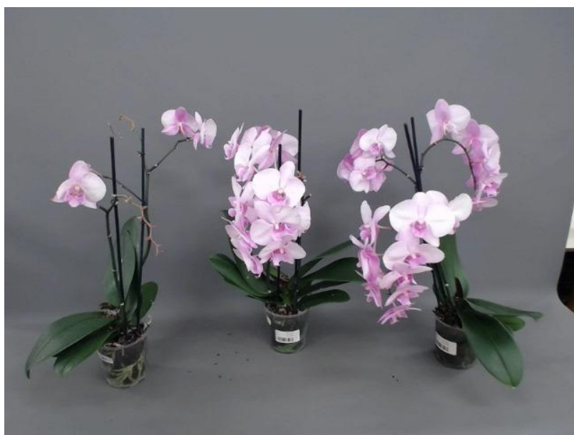
577. Consumer simulation day number 154