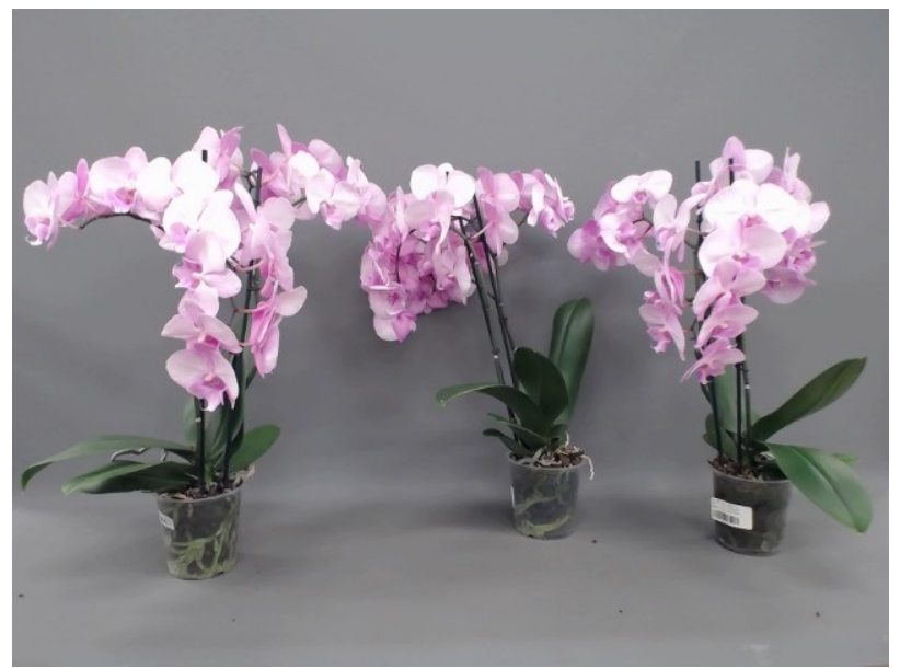
577. Consumer simulation day number 98