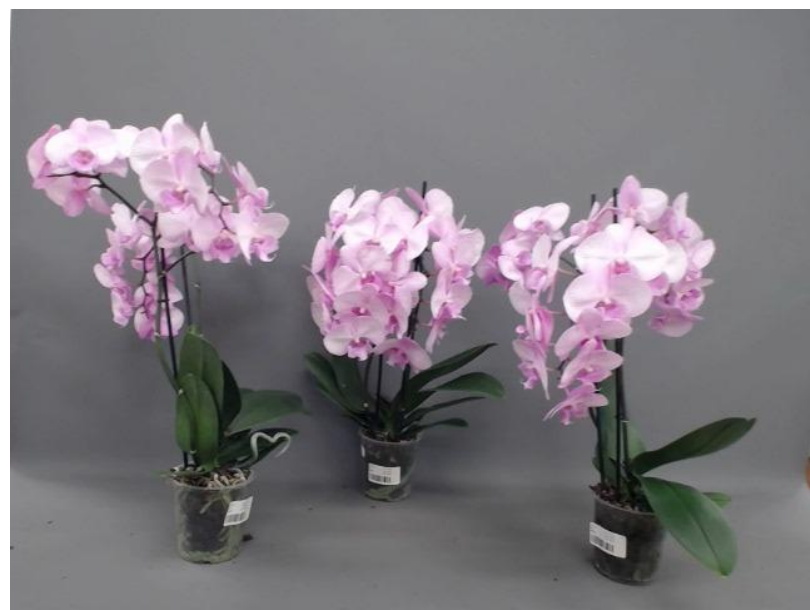
577. Consumer simulation day number 112