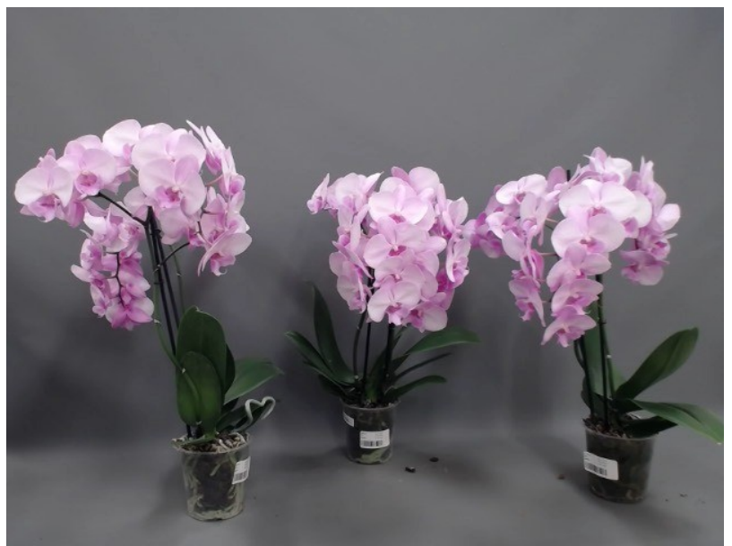
577. Consumer simulation day number 77