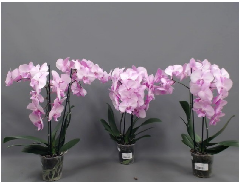
577. Consumer simulation day number 70