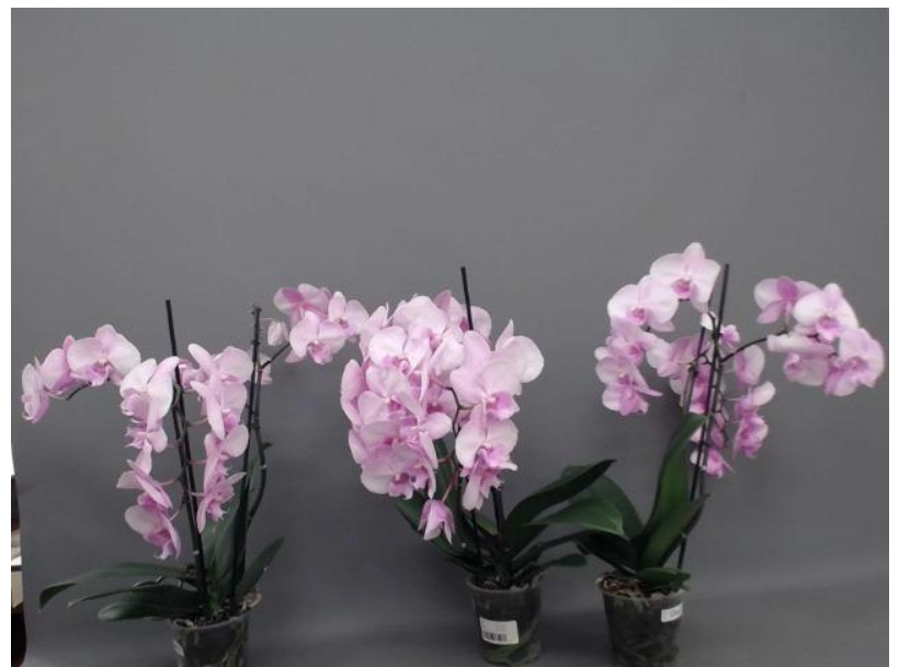
577. Consumer simulation day number 140