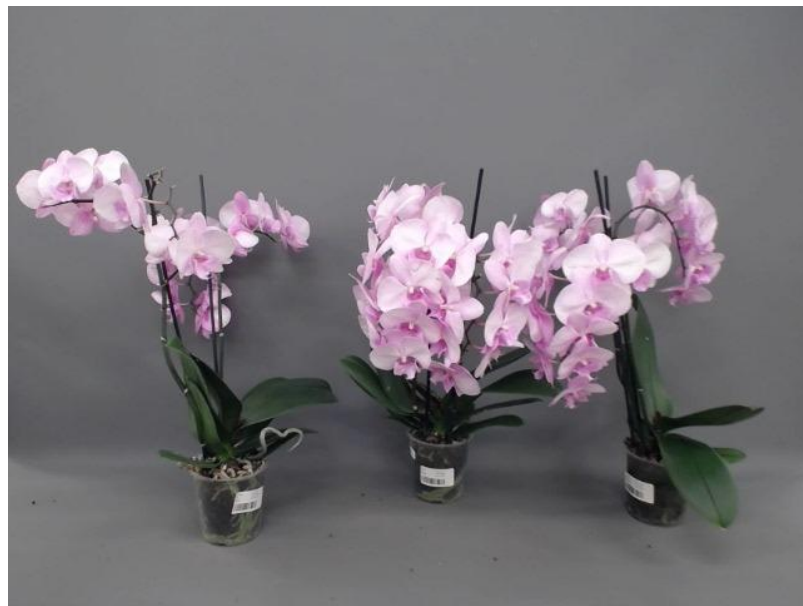
577. Consumer simulation day number 133