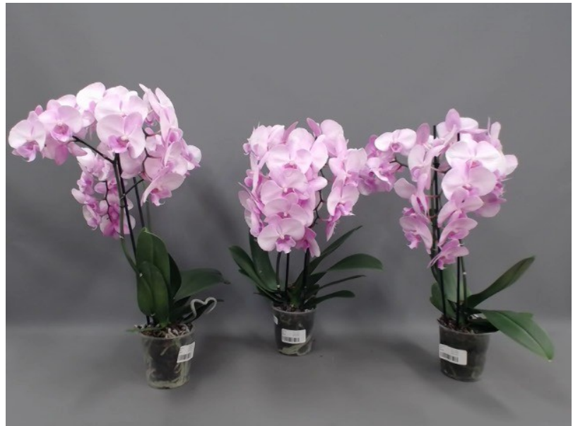
577. Consumer simulation day number 84