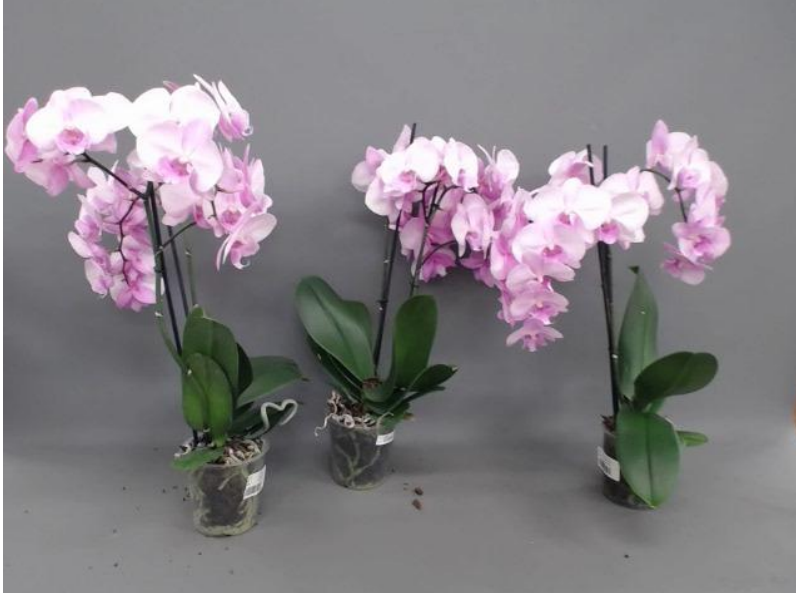
577. Consumer simulation day number 105