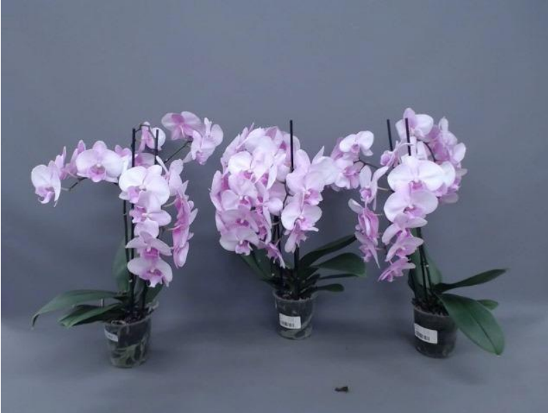
577. Consumer simulation day number 126