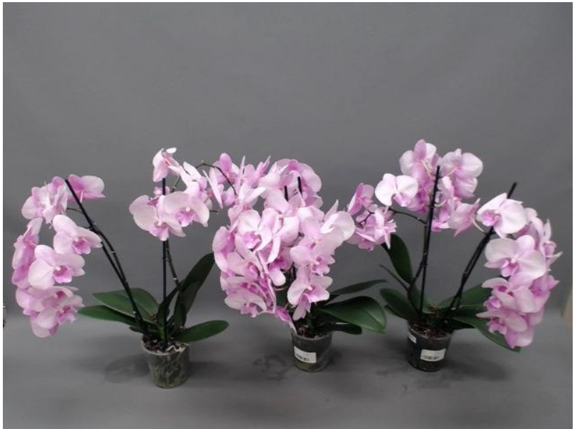
577. Consumer simulation day number 119