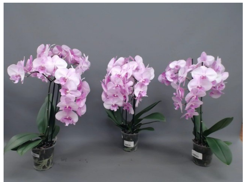
577. Consumer simulation day number 91