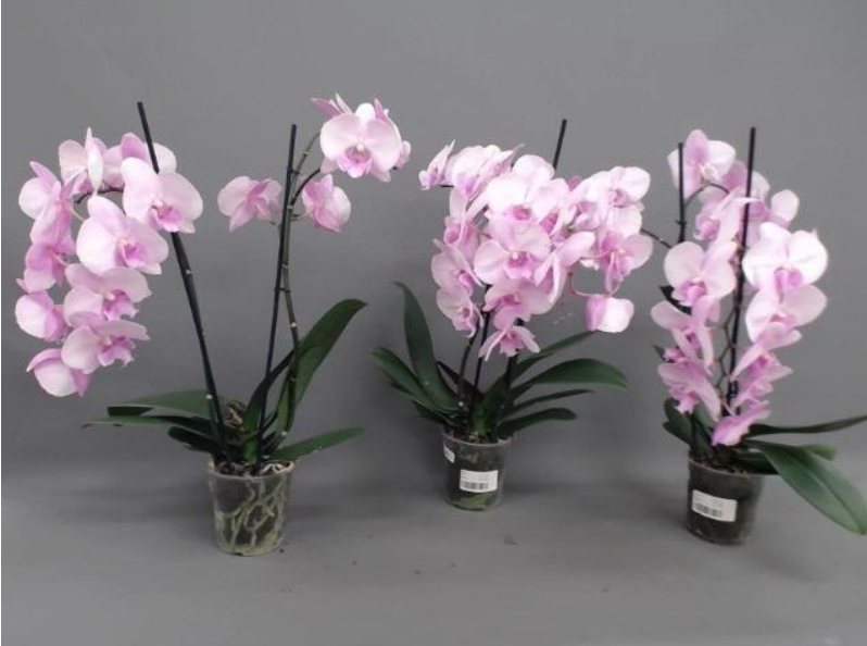
577. Consumer simulation day number 147