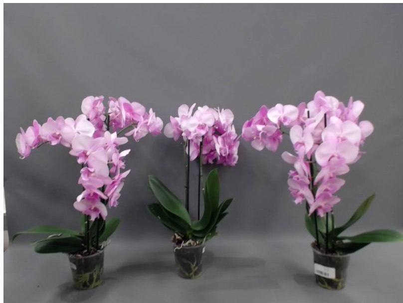
577. Consumer simulation day number 35