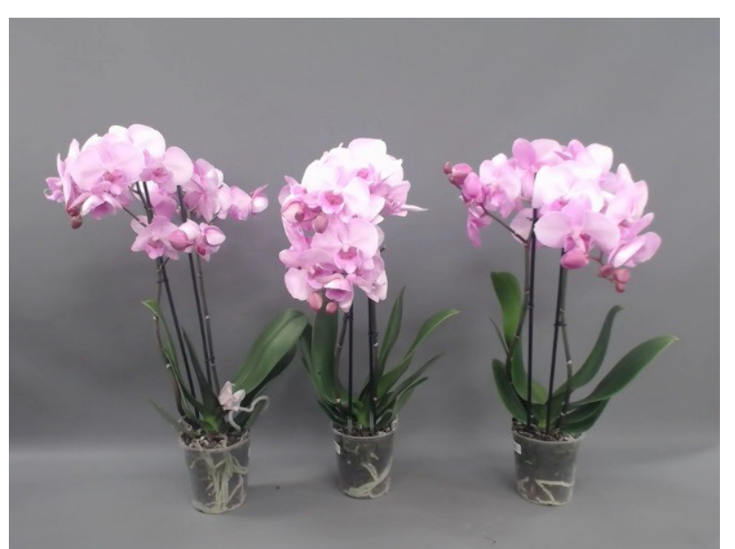
577. Consumer simulation day number 0