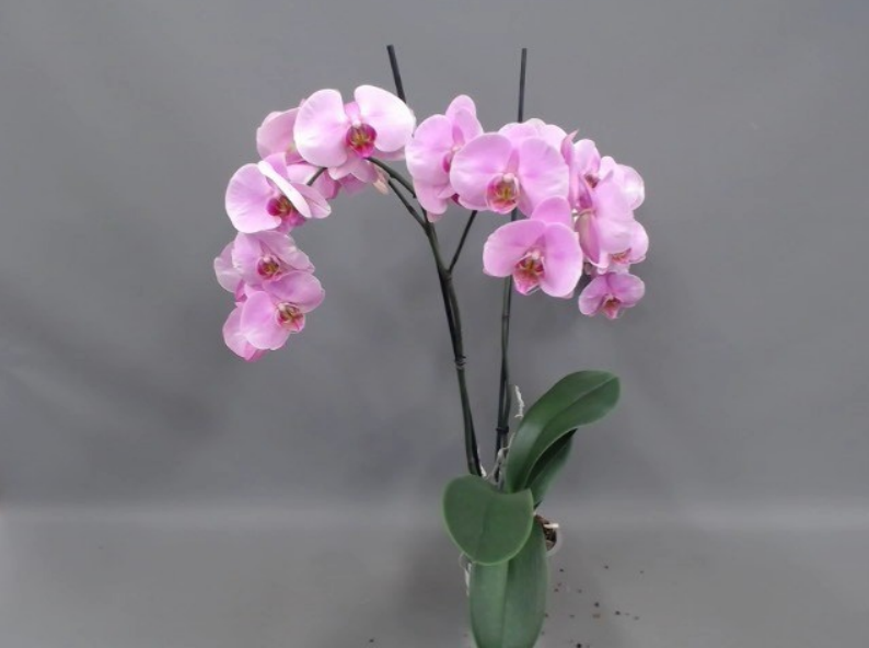
580. Consumer simulation day number 84