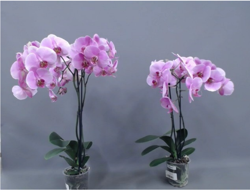
580. Consumer simulation day number 70