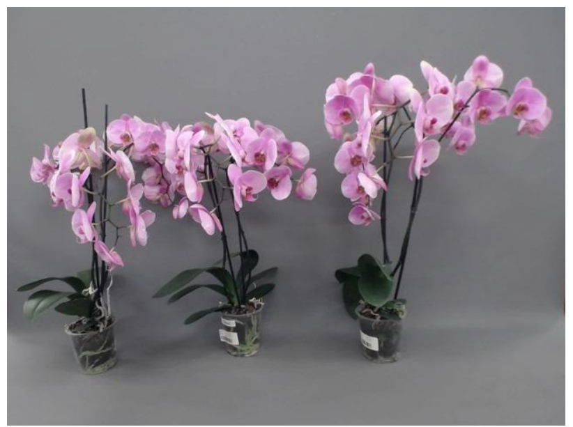
580. Consumer simulation day number 126