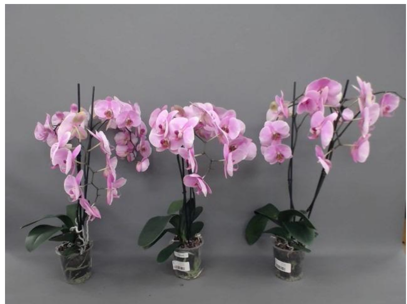
580. Consumer simulation day number 140