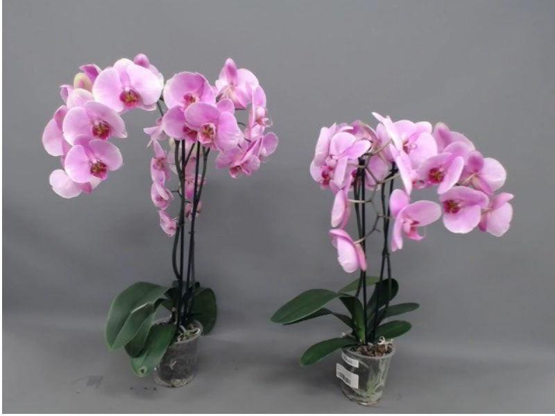
580. Consumer simulation day number 91