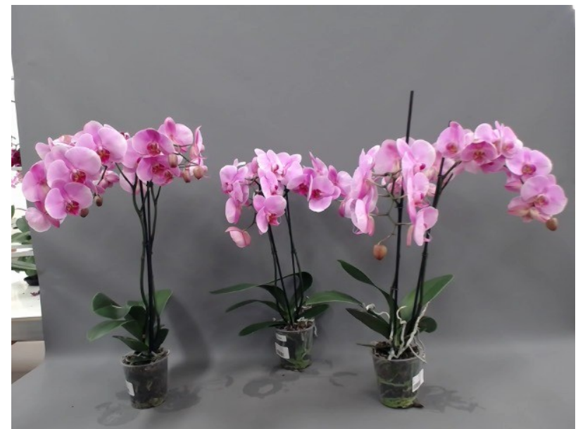
580. Consumer simulation day number 35