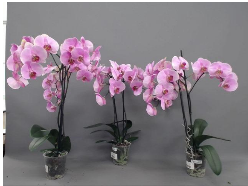
580. Consumer simulation day number 105