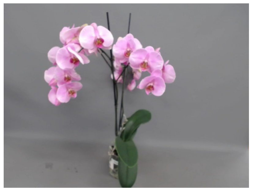
580. Consumer simulation day number 91