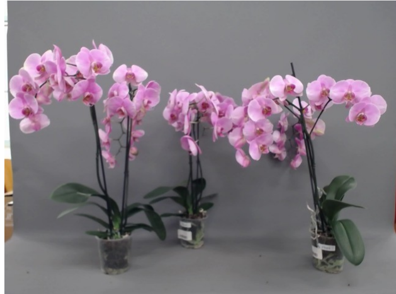
580. Consumer simulation day number 98