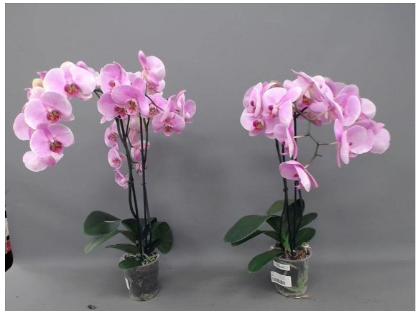
580. Consumer simulation day number 112