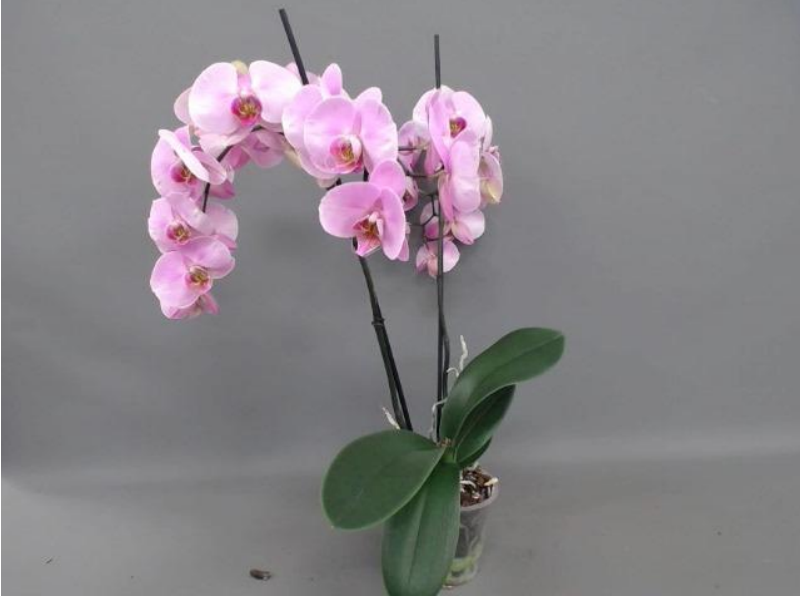
580. Consumer simulation day number 112