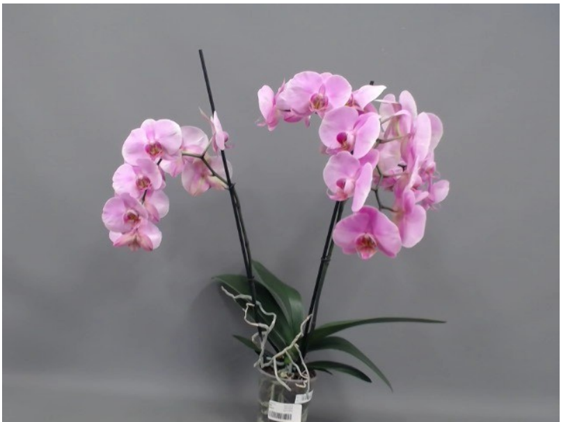
580. Consumer simulation day number 70