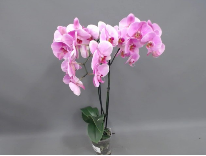
580. Consumer simulation day number 77