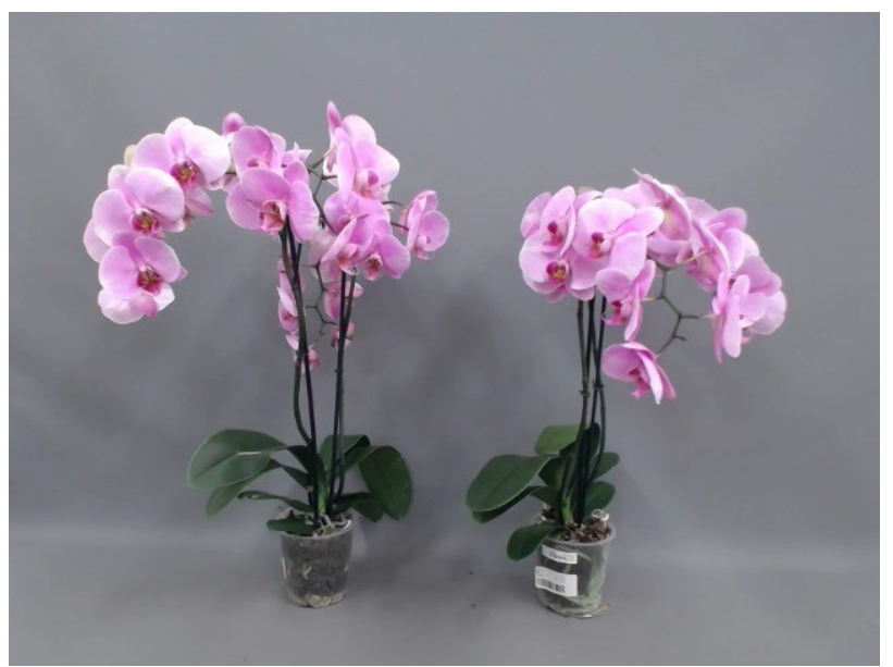
580. Consumer simulation day number 84