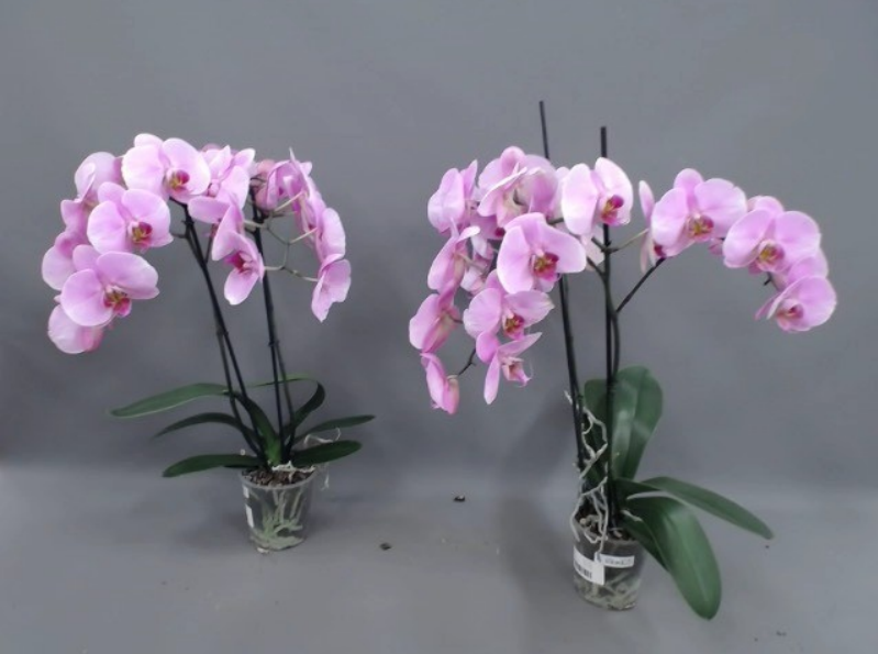
580. Consumer simulation day number 77