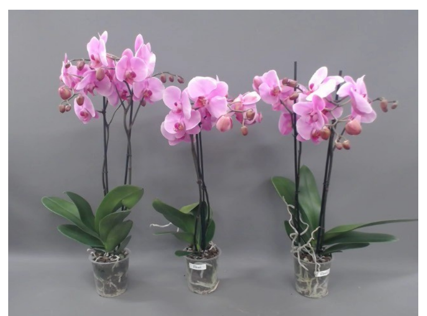
580. Consumer simulation day number 0