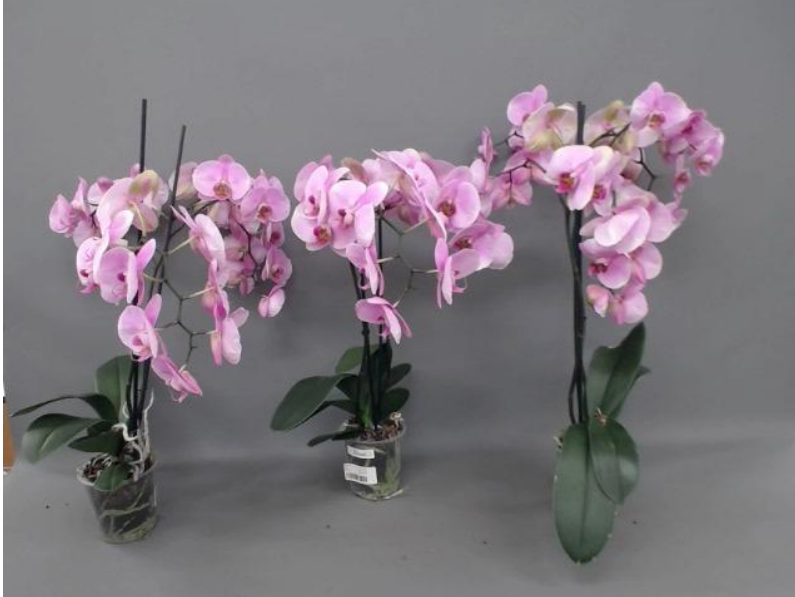
580. Consumer simulation day number 133