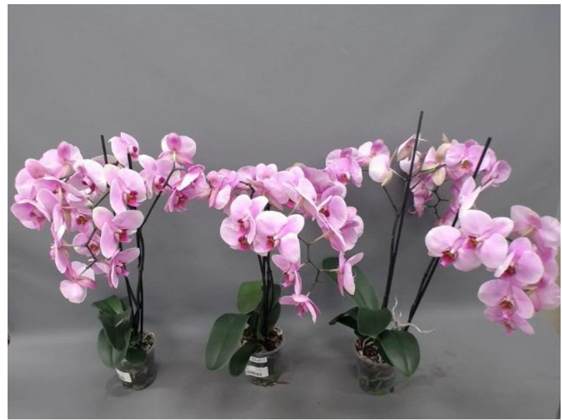
580. Consumer simulation day number 119