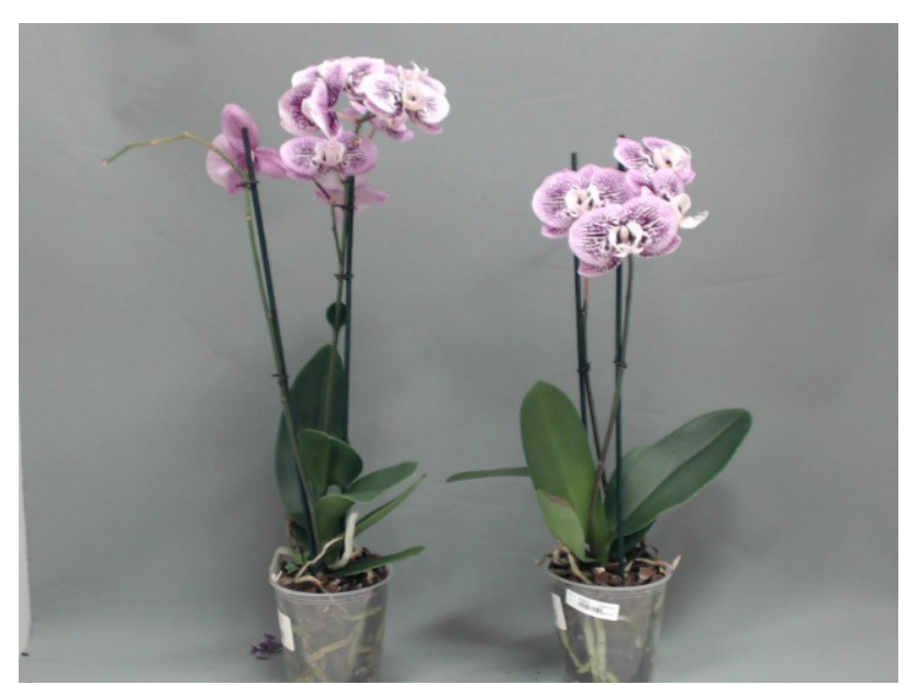
388. Consumer simulation day number 99