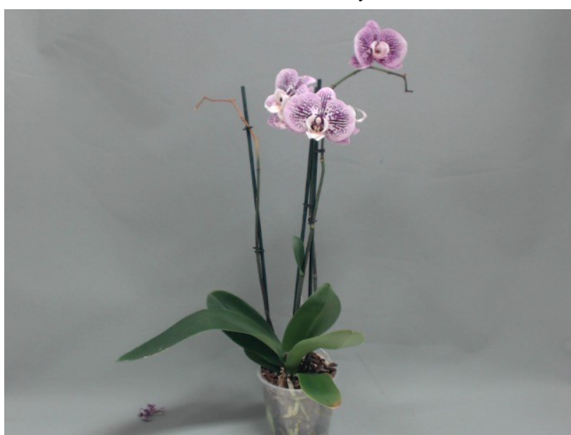
388. Consumer simulation day number 99