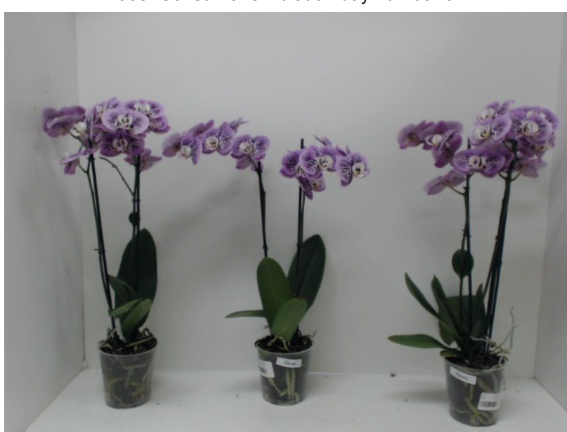
388. Consumer simulation day number 35