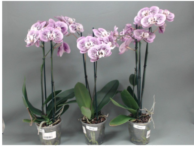
388. Consumer simulation day number 92