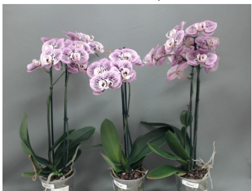
388. Consumer simulation day number 85