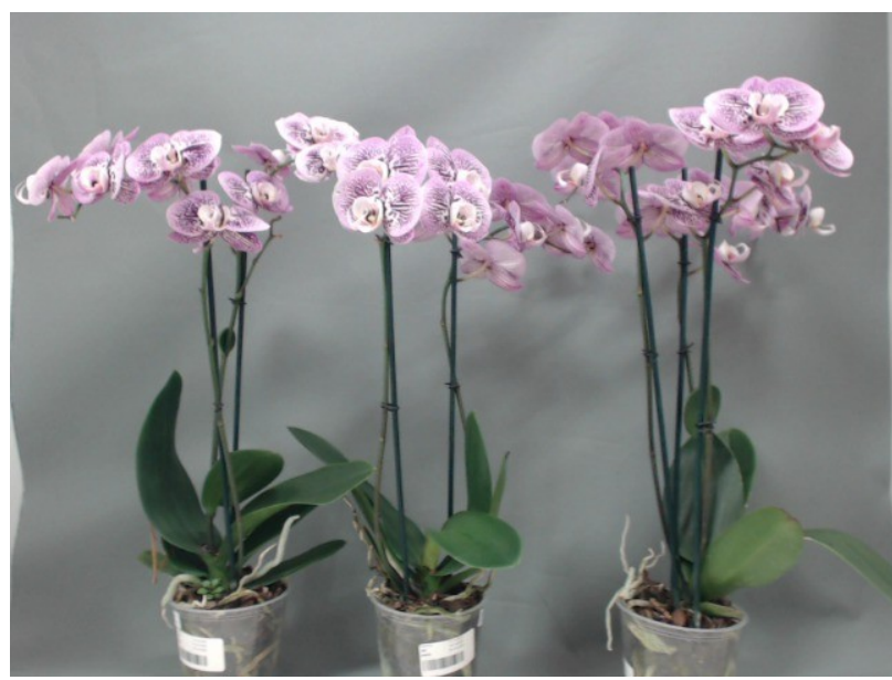
388. Consumer simulation day number 70