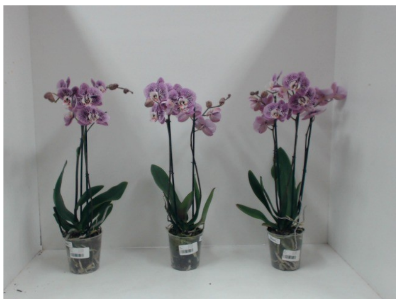
388. Consumer simulation day number 0