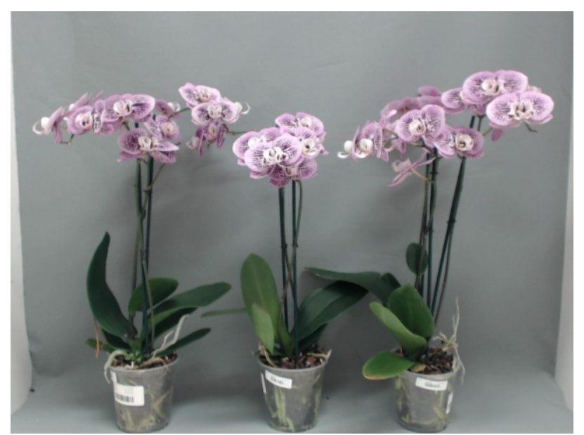
388. Consumer simulation day number 78