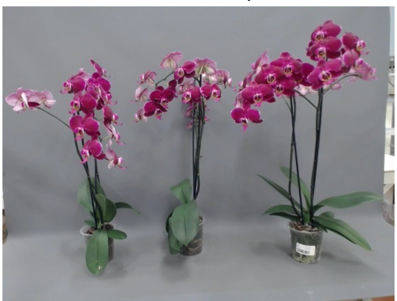
584. Consumer simulation day number 84