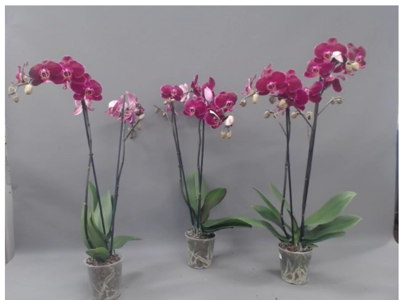
584. Consumer simulation day number 0