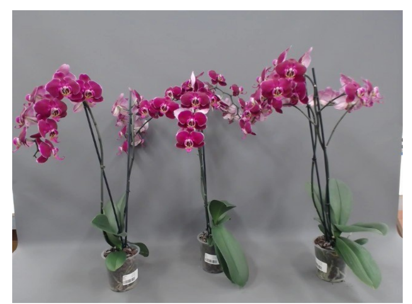
584. Consumer simulation day number 77