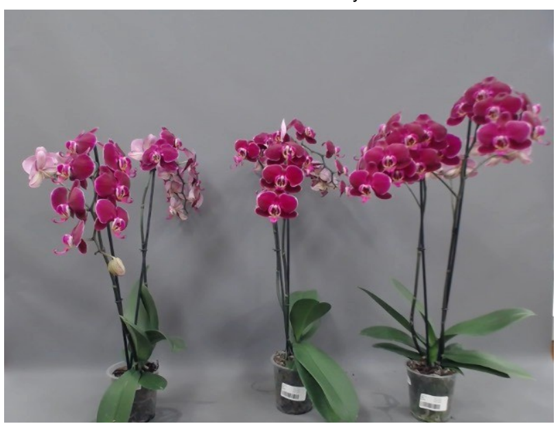
584. Consumer simulation day number 35