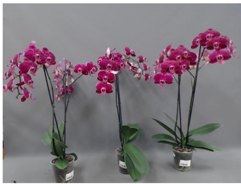
584. Consumer simulation day number 70