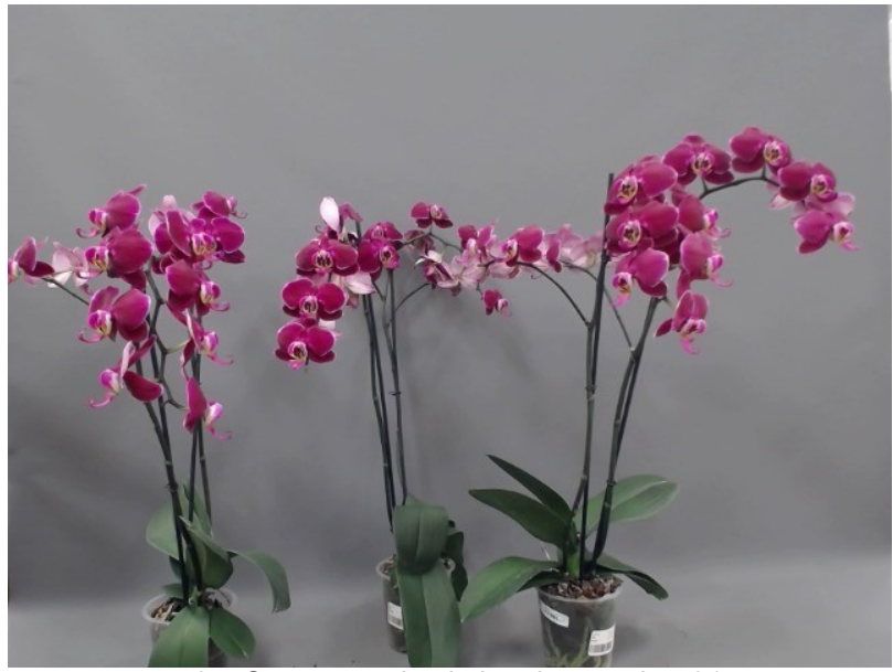
584. Consumer simulation day number 91