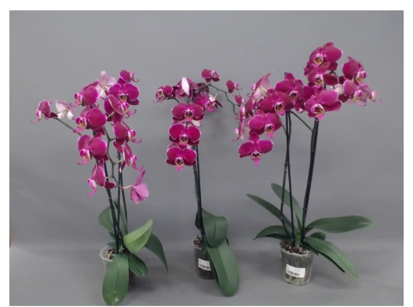
584. Consumer simulation day number 98