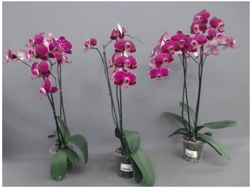
584. Consumer simulation day number 112