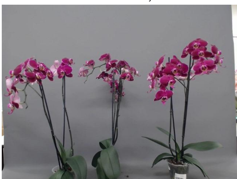
584. Consumer simulation day number 105