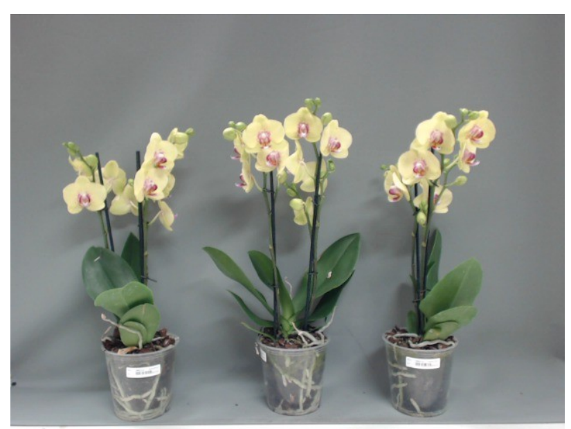
415. Consumer simulation day number 0