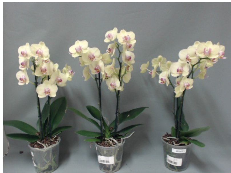
415. Consumer simulation day number 70