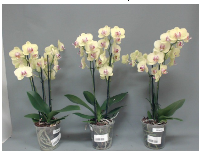
415. Consumer simulation day number 35