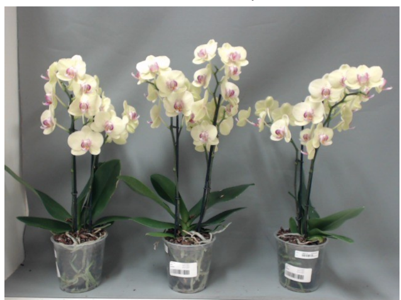
415. Consumer simulation day number 91