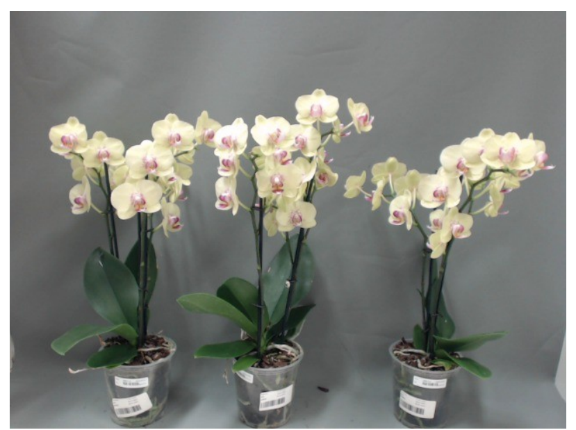
415. Consumer simulation day number 77