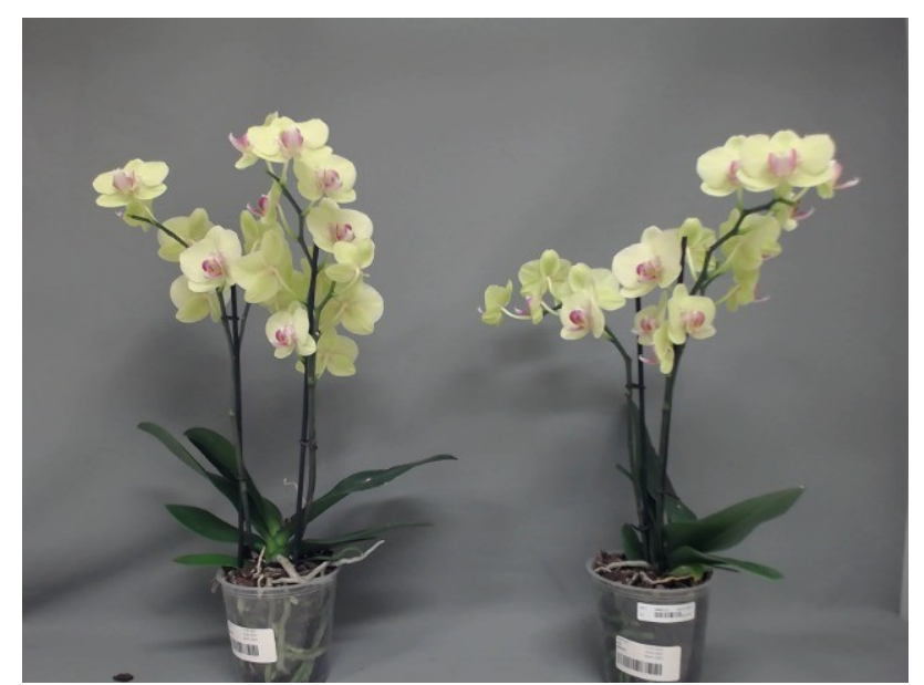
415. Consumer simulation day number 126