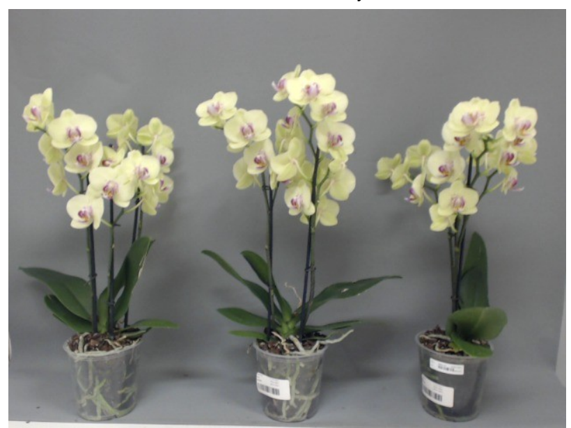
415. Consumer simulation day number 84