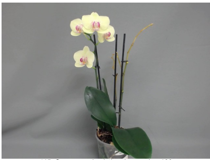
415. Consumer simulation day number 126