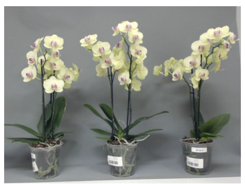
415. Consumer simulation day number 98