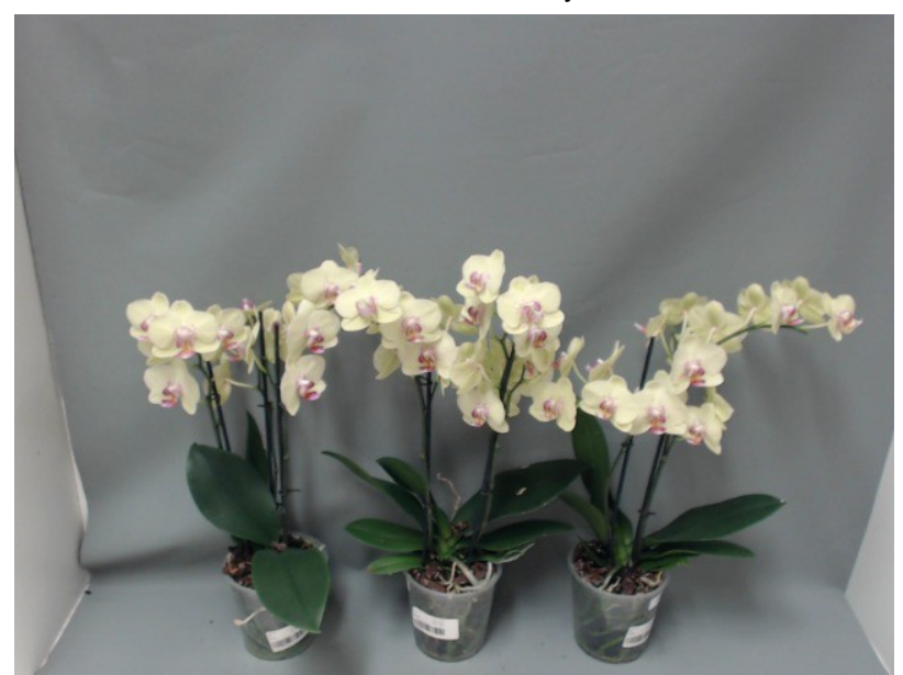
415. Consumer simulation day number 112