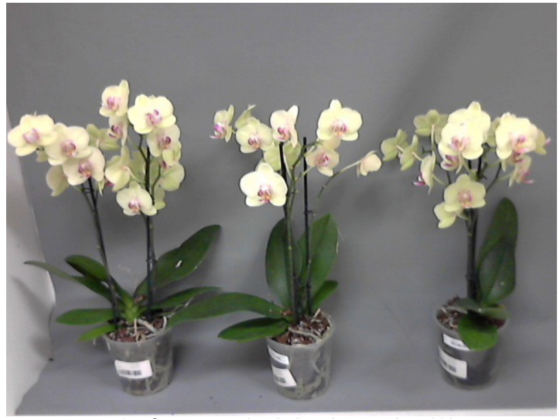
415. Consumer simulation day number 119