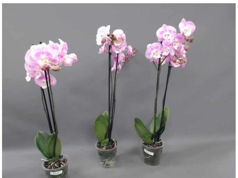
642. Consumer simulation day number 0