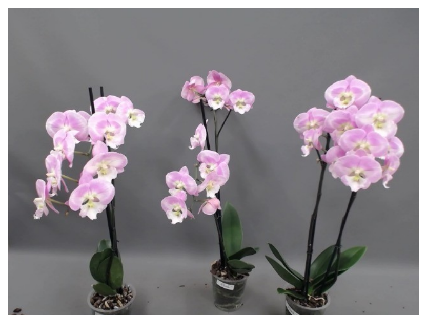
642. Consumer simulation day number 77