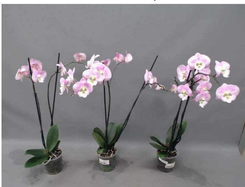
642. Consumer simulation day number 105