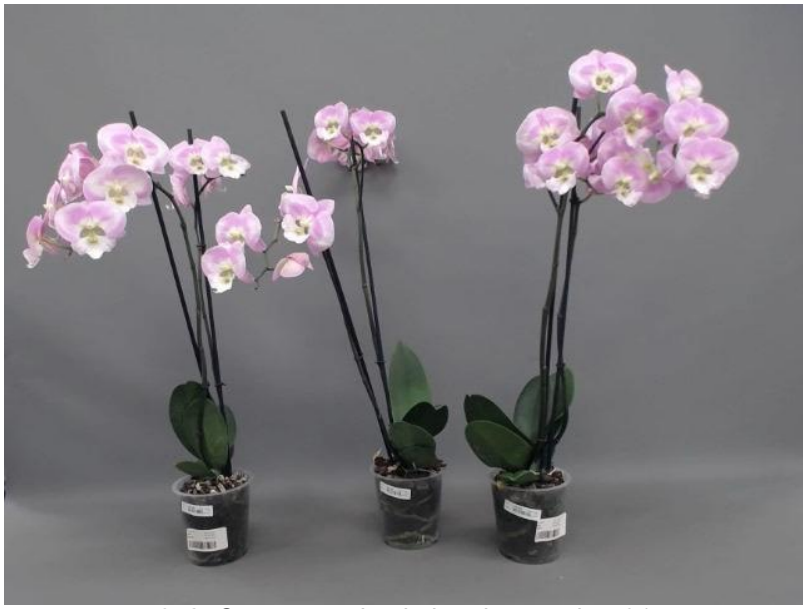
642. Consumer simulation day number 91