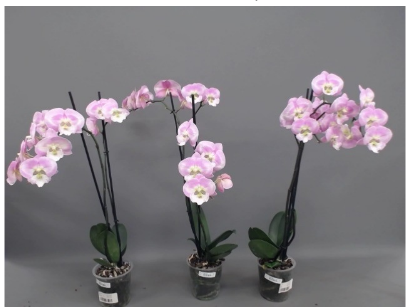
642. Consumer simulation day number 84