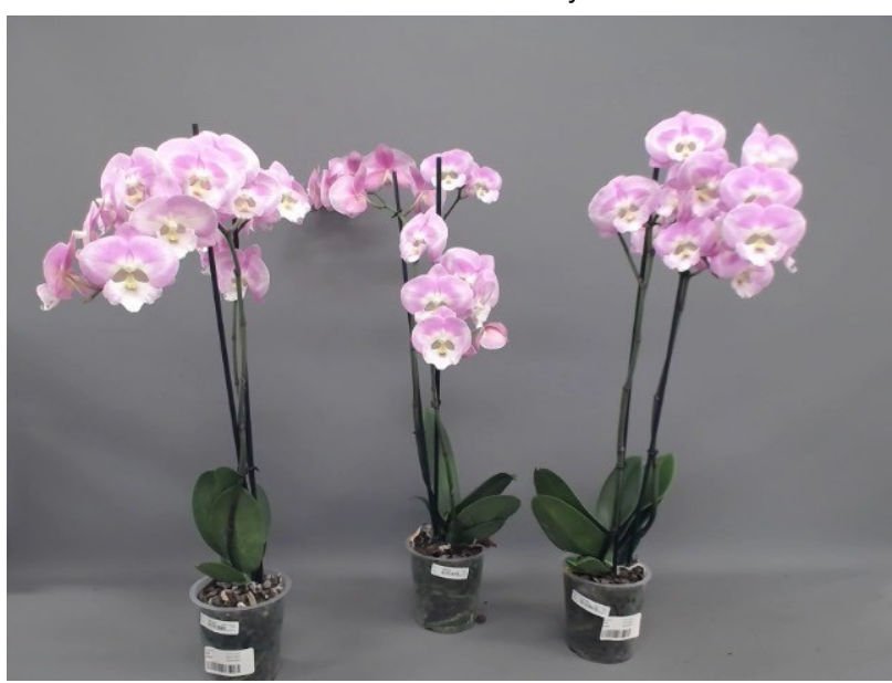
642. Consumer simulation day number 35