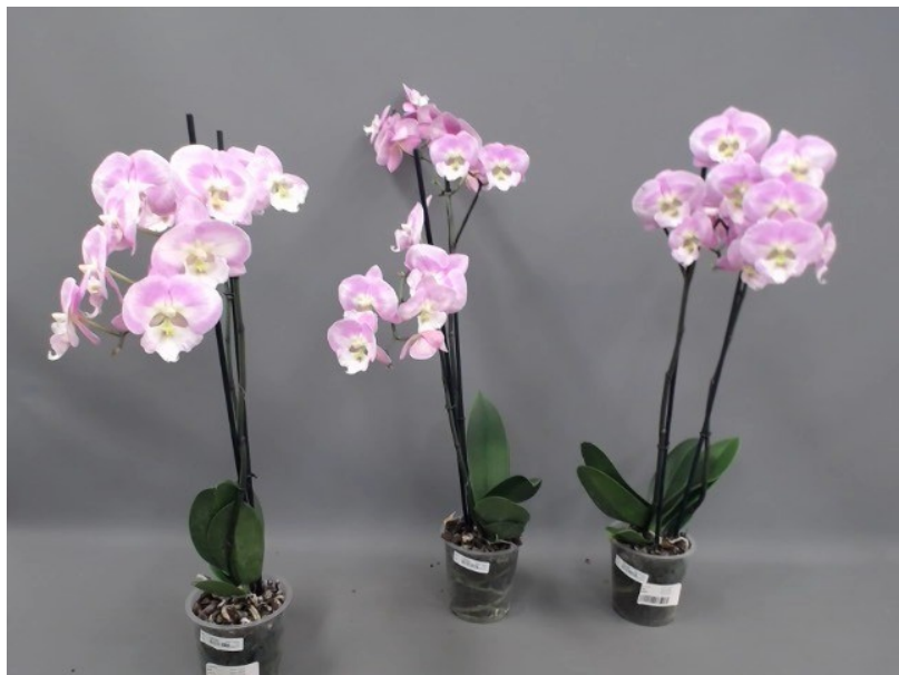
642. Consumer simulation day number 70