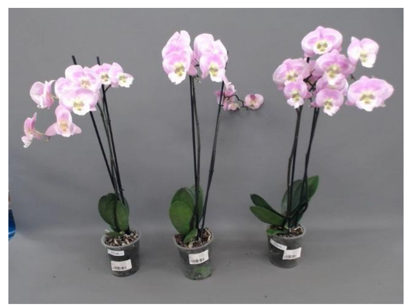
642. Consumer simulation day number 98