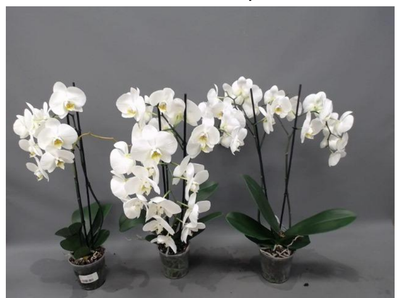
640. Consumer simulation day number 105