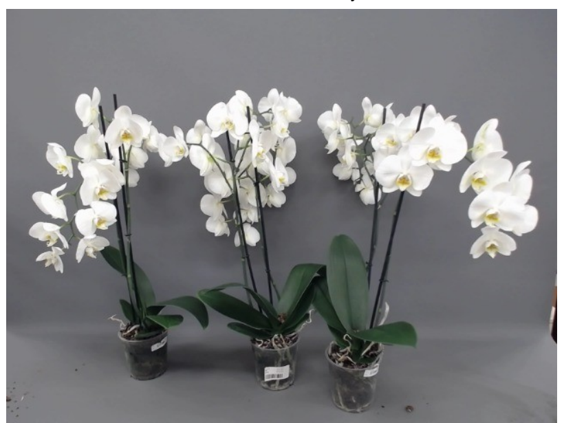
640. Consumer simulation day number 84