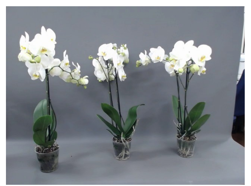
640. Consumer simulation day number 0