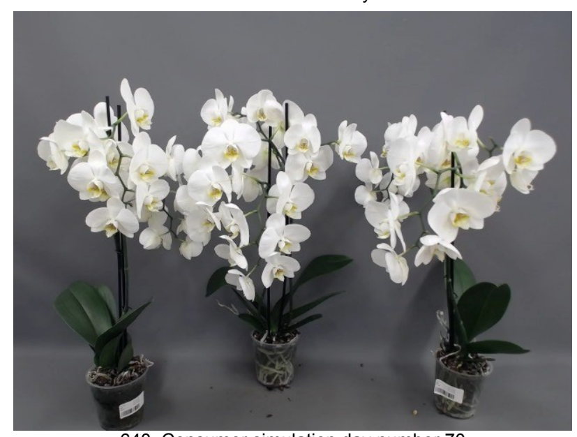
640. Consumer simulation day number 70