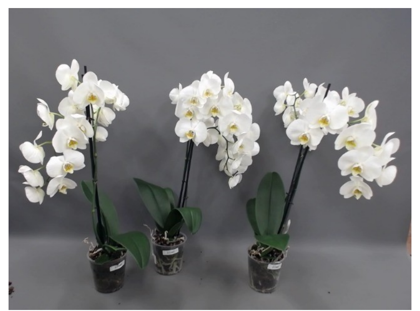
640. Consumer simulation day number 77