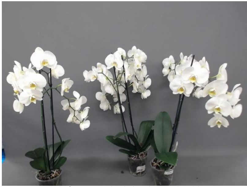
640. Consumer simulation day number 91