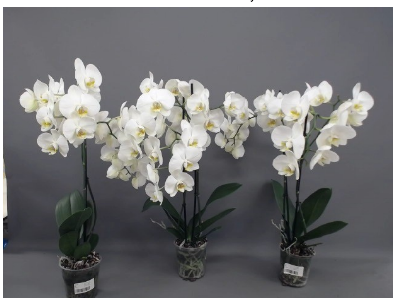
640. Consumer simulation day number 35