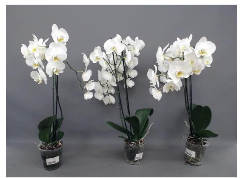
640. Consumer simulation day number 98