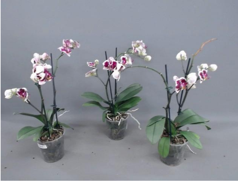
645. Consumer simulation day number 70