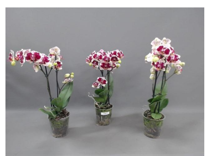
645. Consumer simulation day number 0