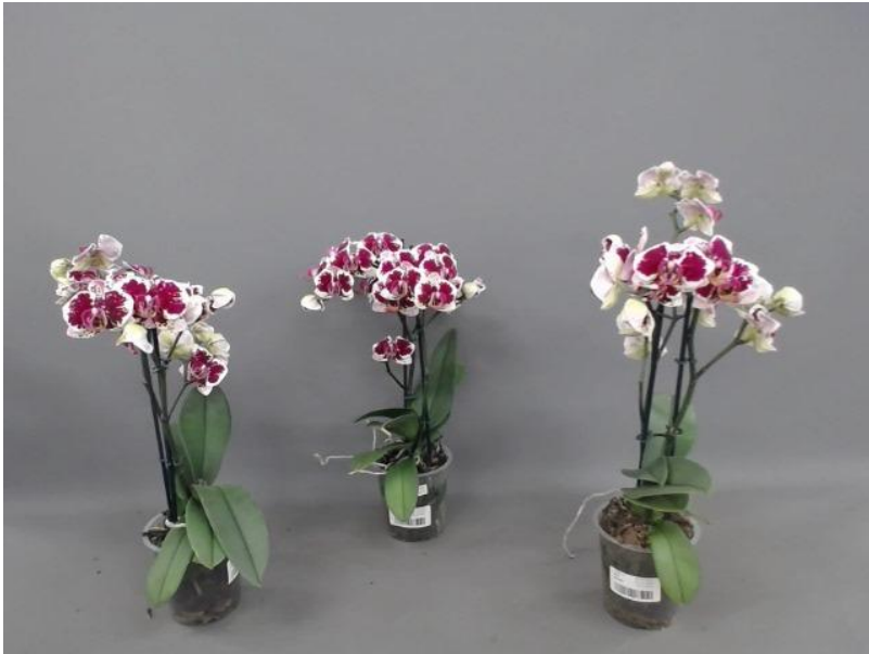
645. Consumer simulation day number 35