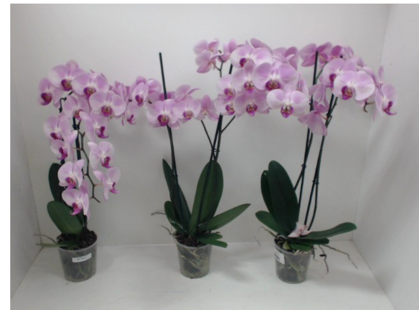
378. Consumer simulation day number 70