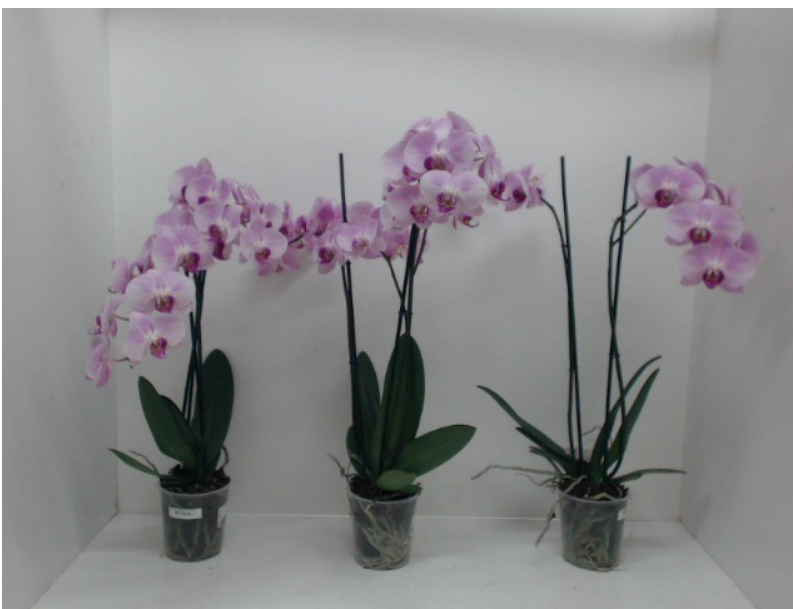
378. Consumer simulation day number 77