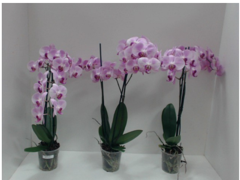
378. Consumer simulation day number 35