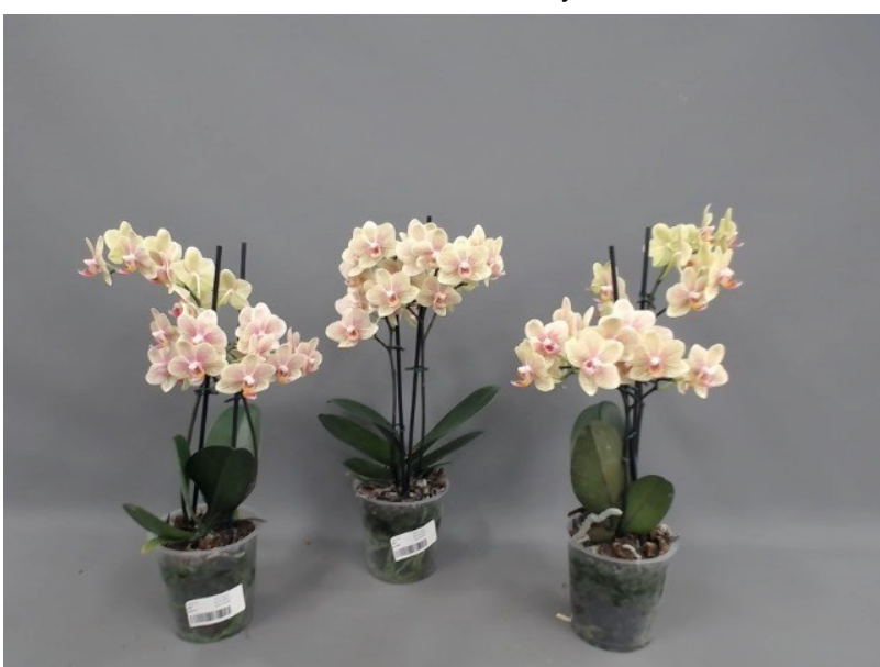
608. Consumer simulation day number 35