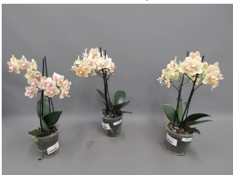
608. Consumer simulation day number 84