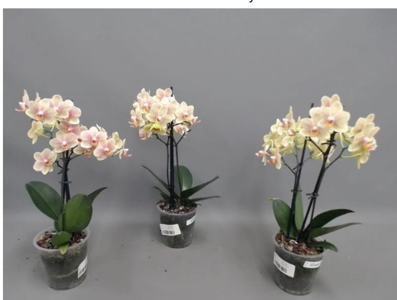
608. Consumer simulation day number 70