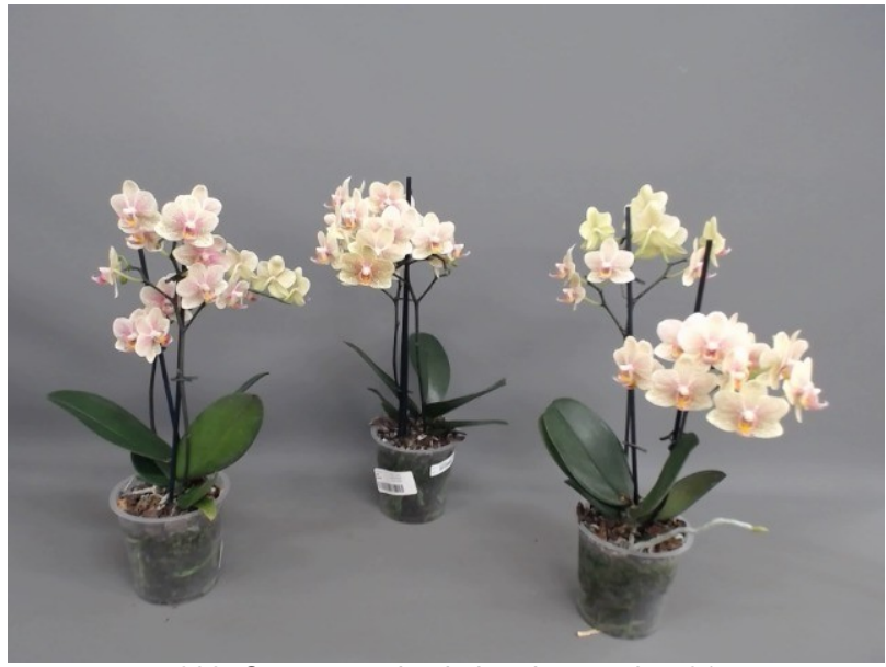
608. Consumer simulation day number 91