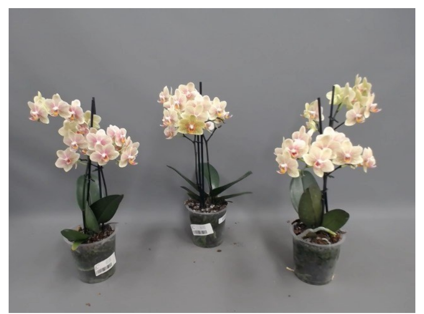
608. Consumer simulation day number 77