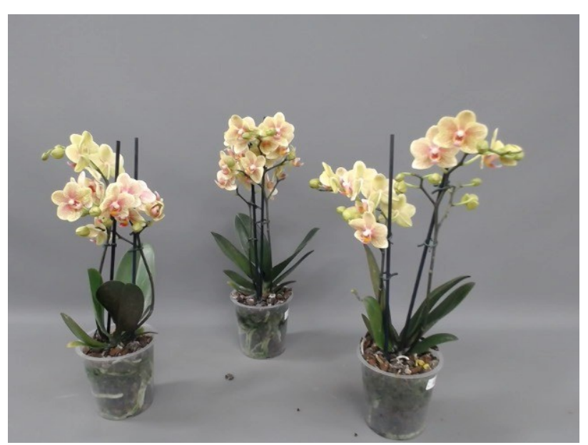
608. Consumer simulation day number 0