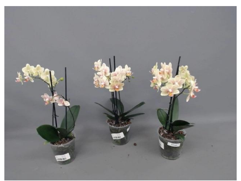
608. Consumer simulation day number 98