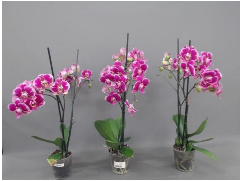
618. Consumer simulation day number 154