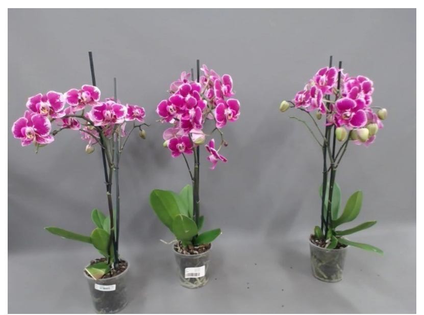
618. Consumer simulation day number 77