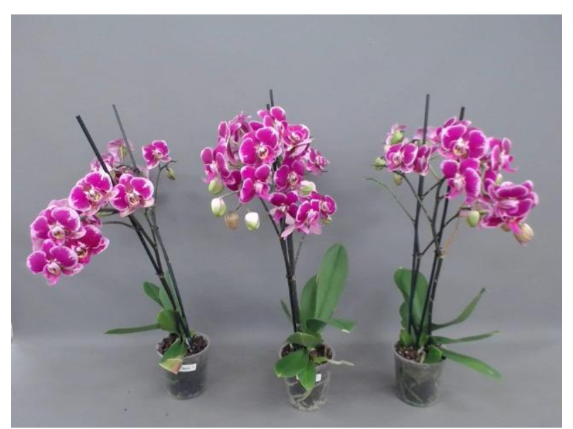
618. Consumer simulation day number 140