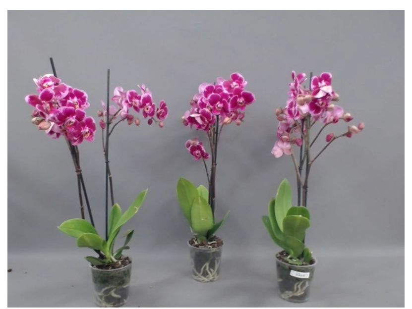
618. Consumer simulation day number 0