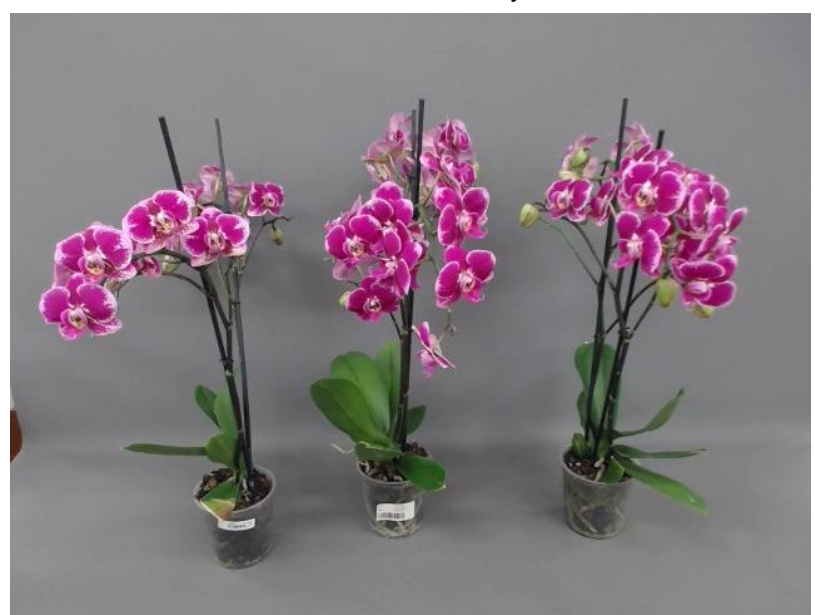
618. Consumer simulation day number 105