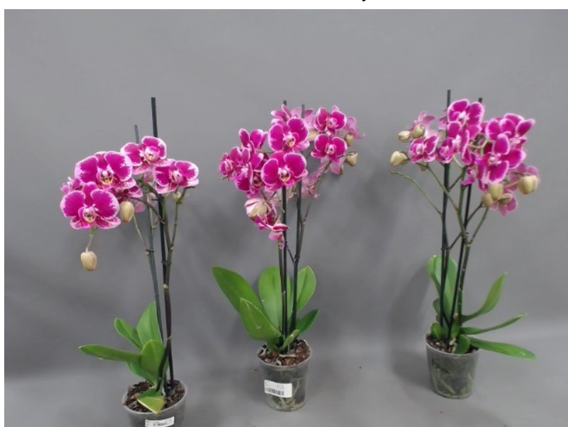
618. Consumer simulation day number 35