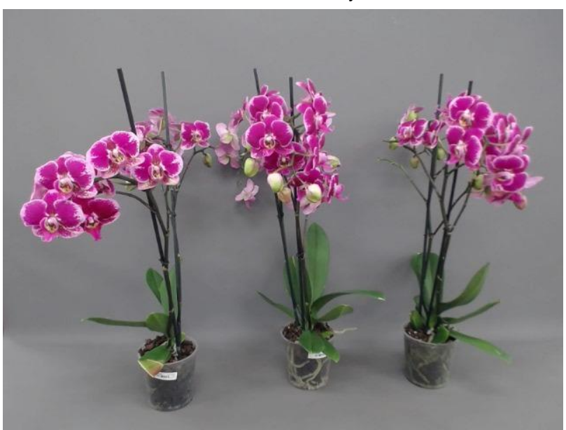
618. Consumer simulation day number 126