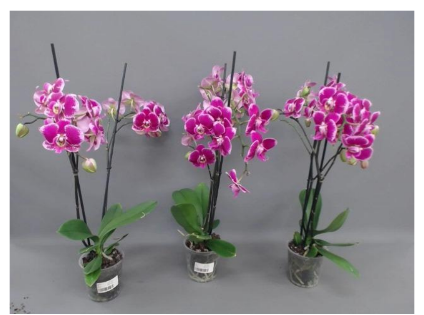
618. Consumer simulation day number 119