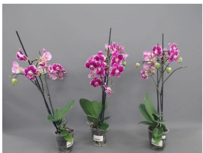
618. Consumer simulation day number 161