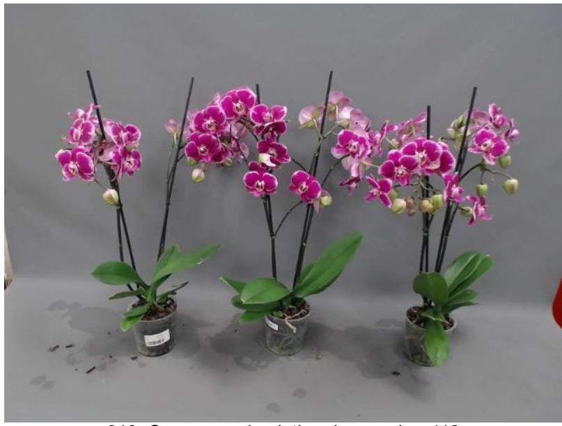
618. Consumer simulation day number 112