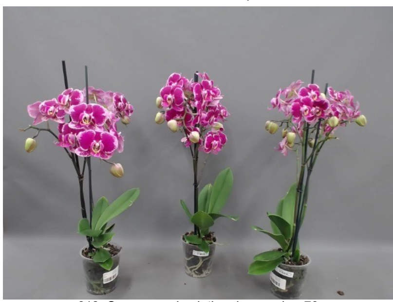
618. Consumer simulation day number 70