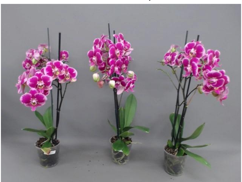
618. Consumer simulation day number 147