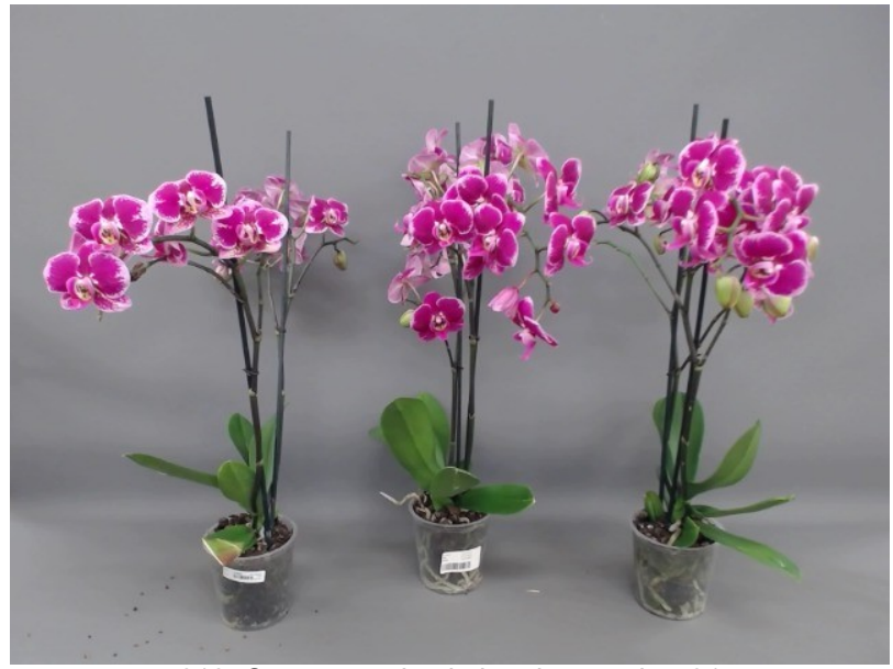
618. Consumer simulation day number 91