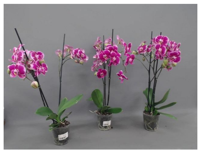
618. Consumer simulation day number 98