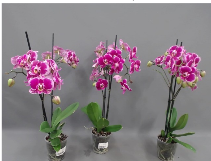
618. Consumer simulation day number 84