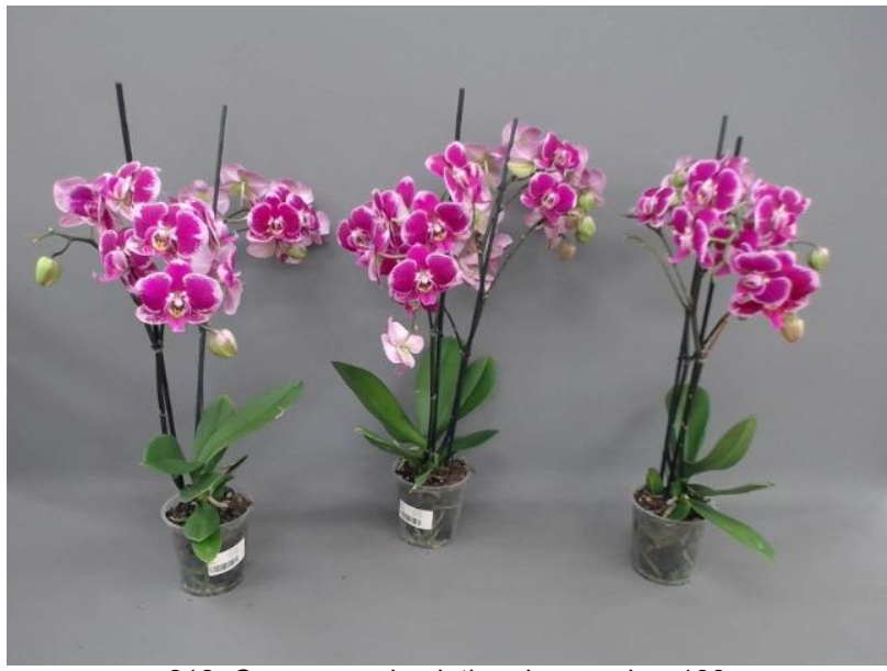
618. Consumer simulation day number 133