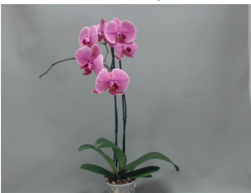
389. Consumer simulation day number 99