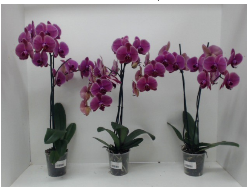
389. Consumer simulation day number 35