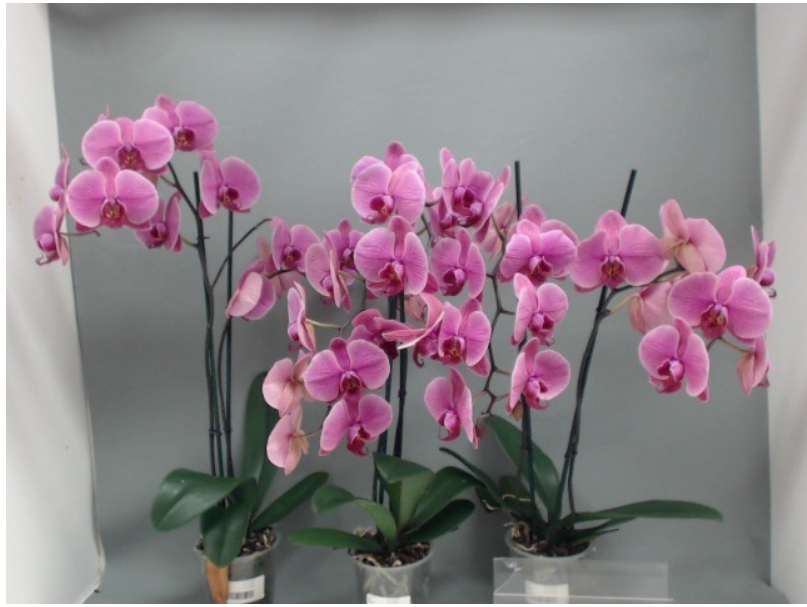
389. Consumer simulation day number 92