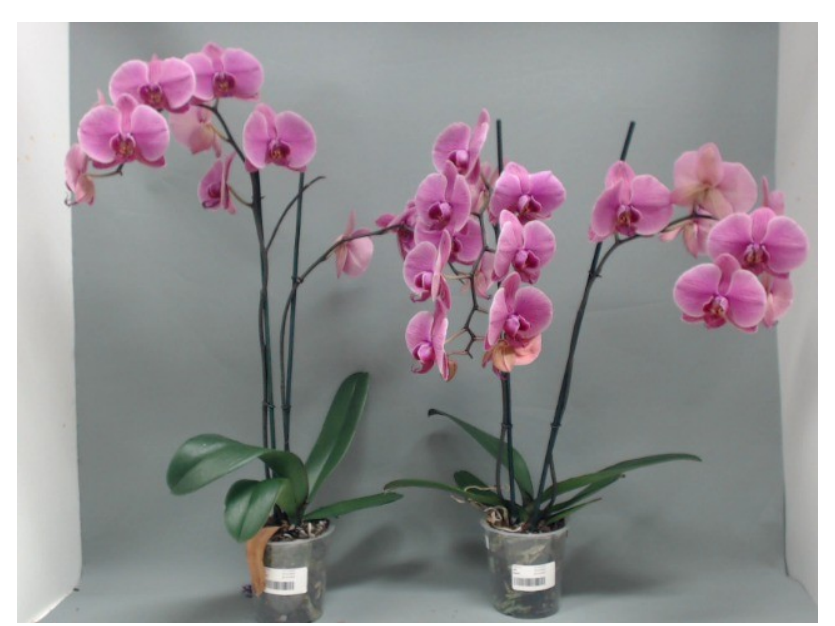
389. Consumer simulation day number 99