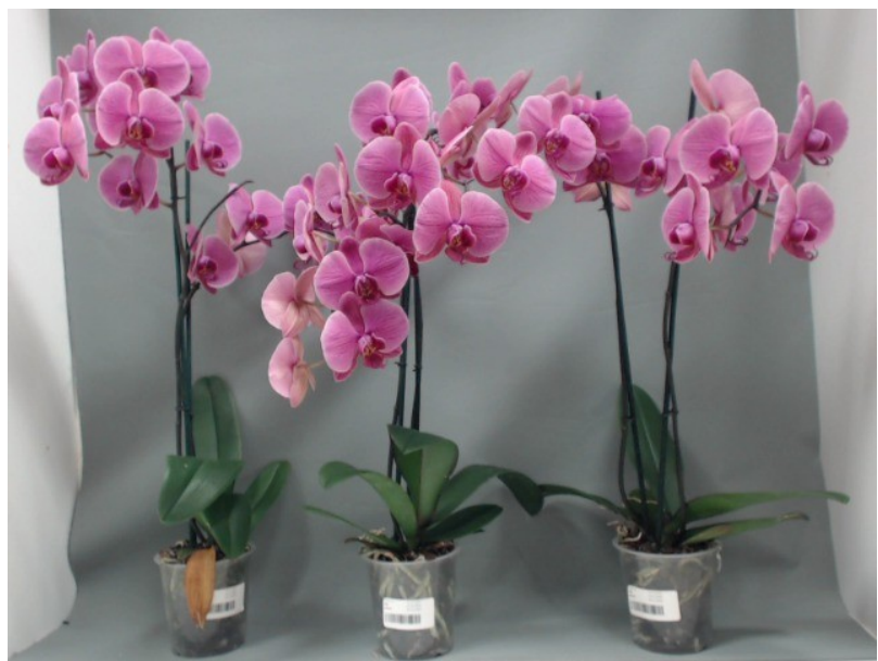
389. Consumer simulation day number 70