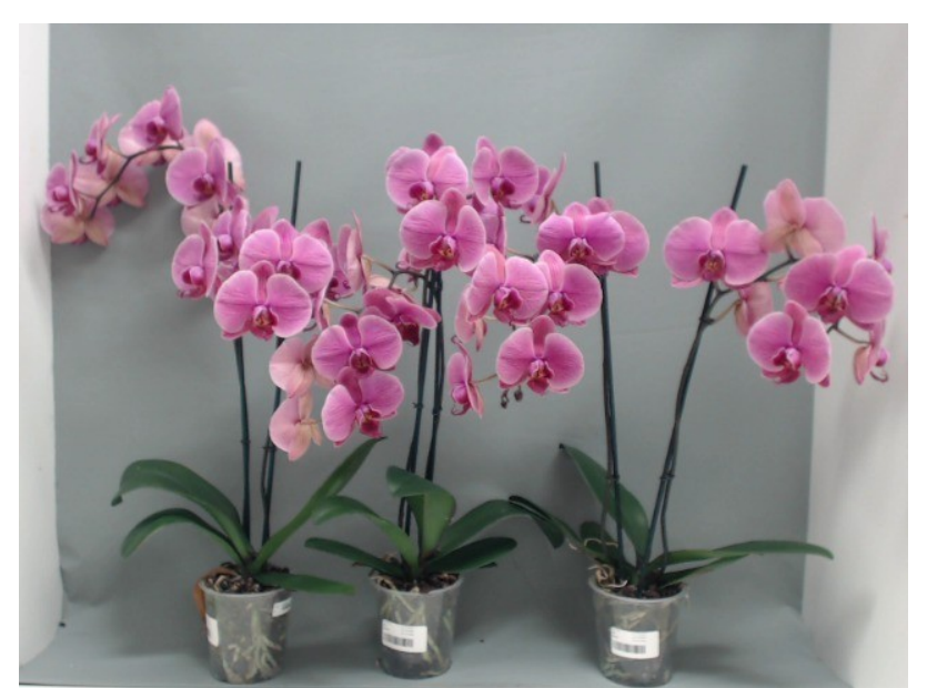
389. Consumer simulation day number 78