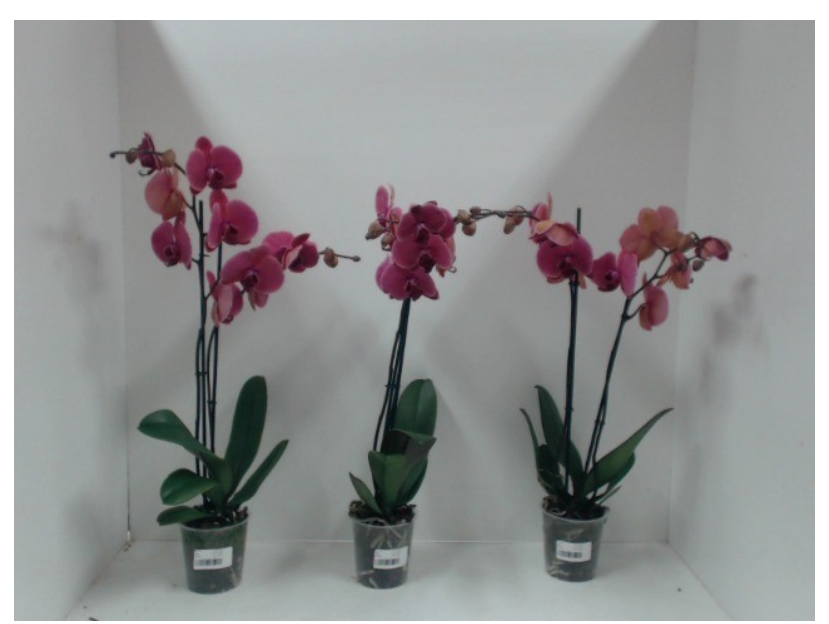
389. Consumer simulation day number 0