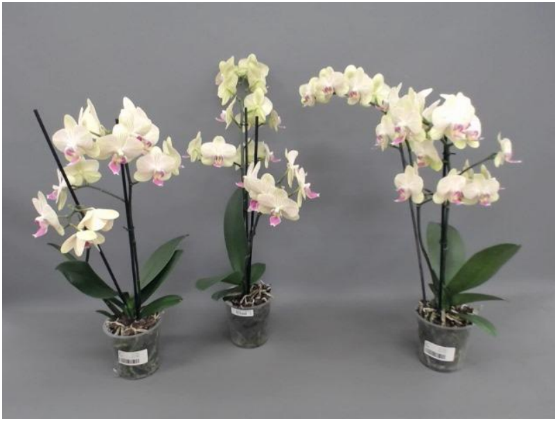
597. Consumer simulation day number 133