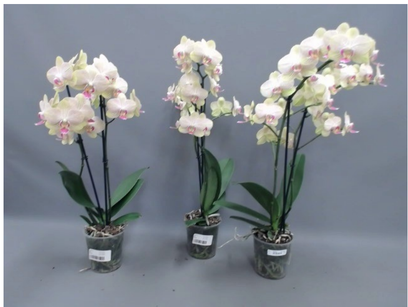
597. Consumer simulation day number 70