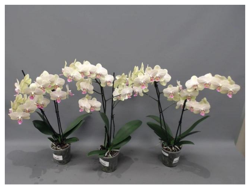
597. Consumer simulation day number 119