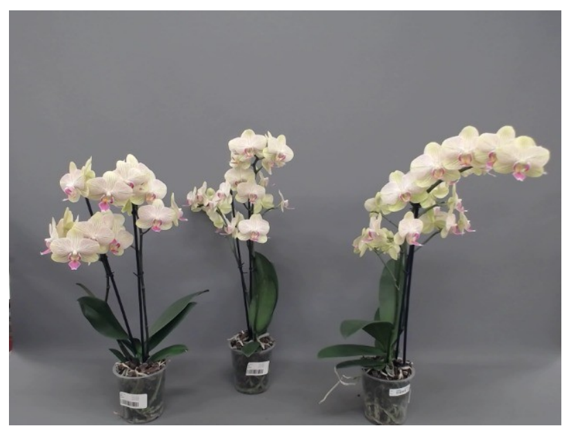
597. Consumer simulation day number 98