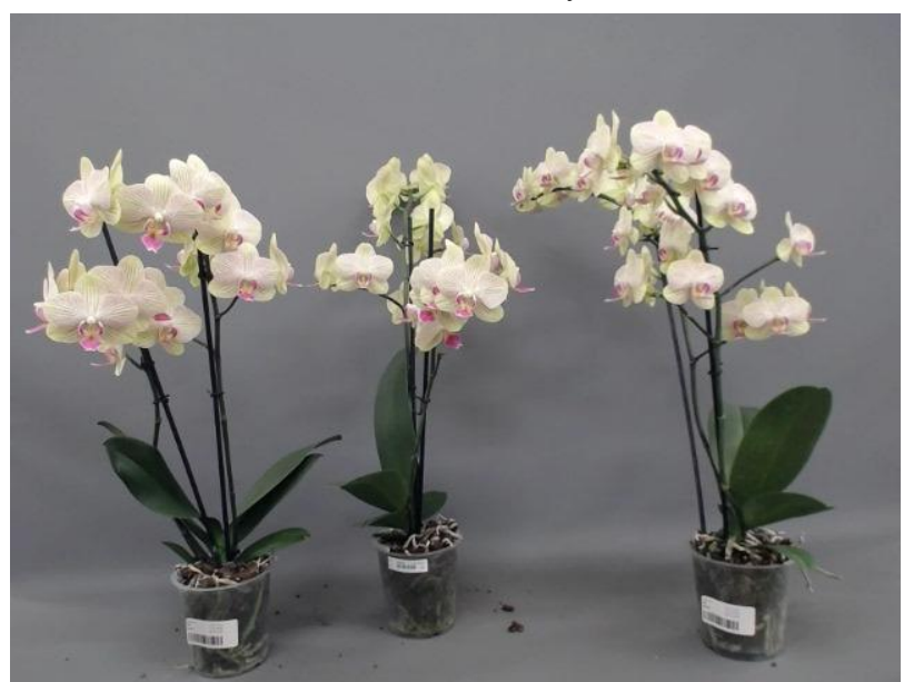
597. Consumer simulation day number 105