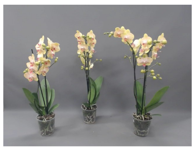
597. Consumer simulation day number 0