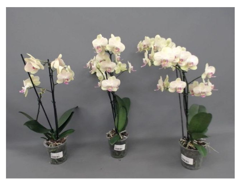
597. Consumer simulation day number 140