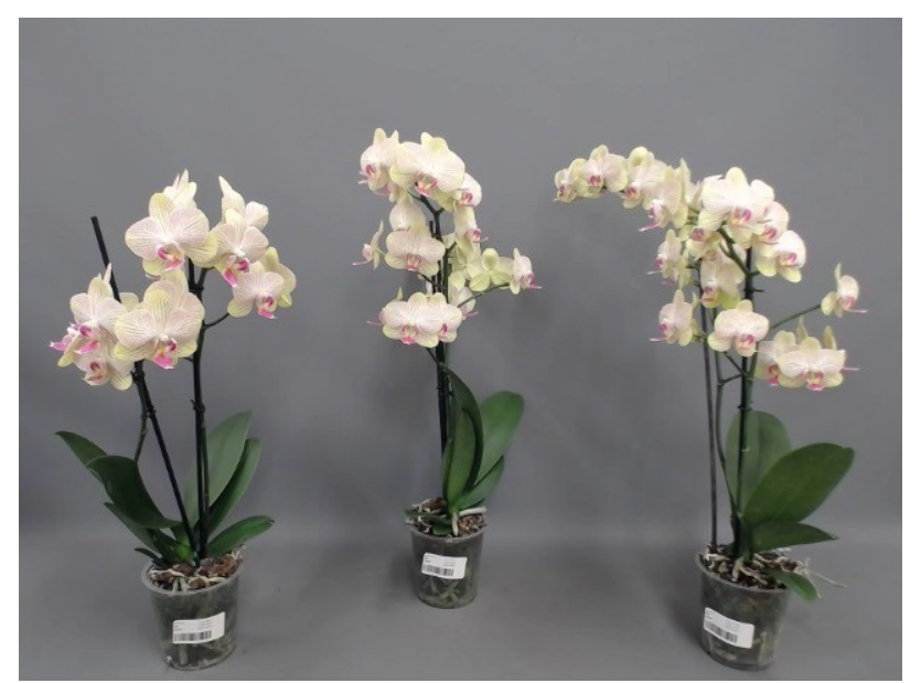
597. Consumer simulation day number 77