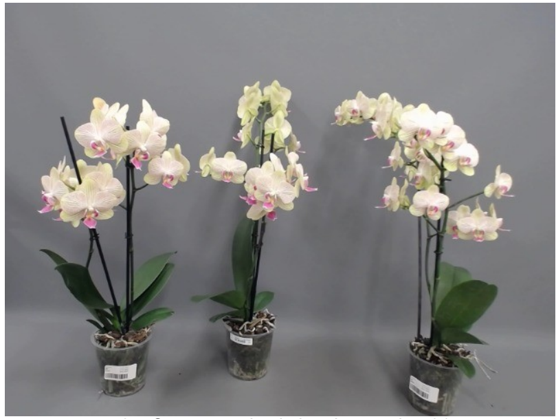
597. Consumer simulation day number 91