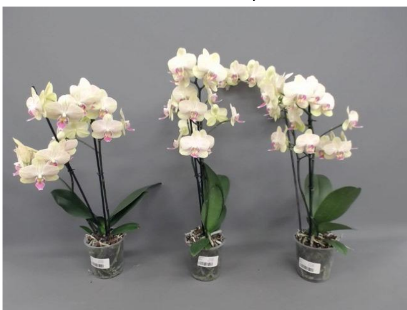
597. Consumer simulation day number 126