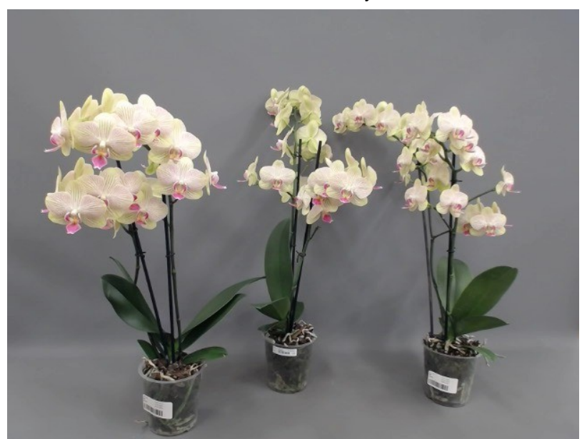
597. Consumer simulation day number 84