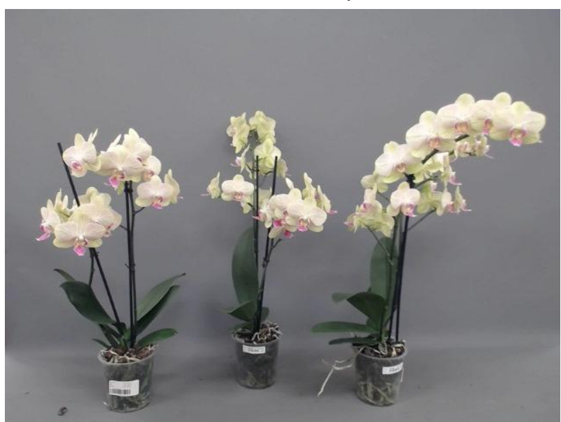
597. Consumer simulation day number 112