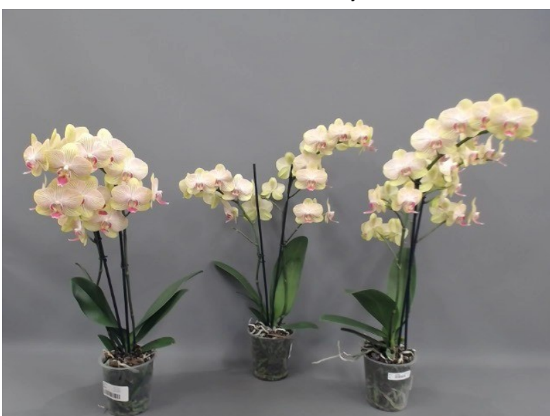
597. Consumer simulation day number 35