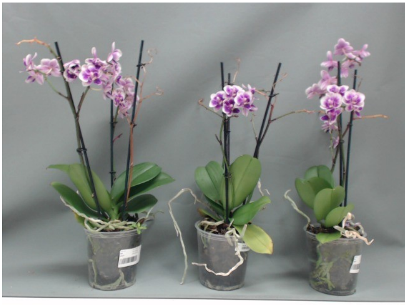
390. Consumer simulation day number 70