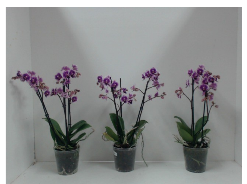
390. Consumer simulation day number 0