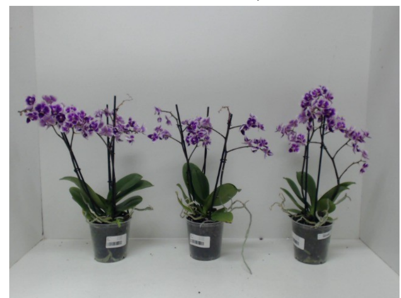
390. Consumer simulation day number 35