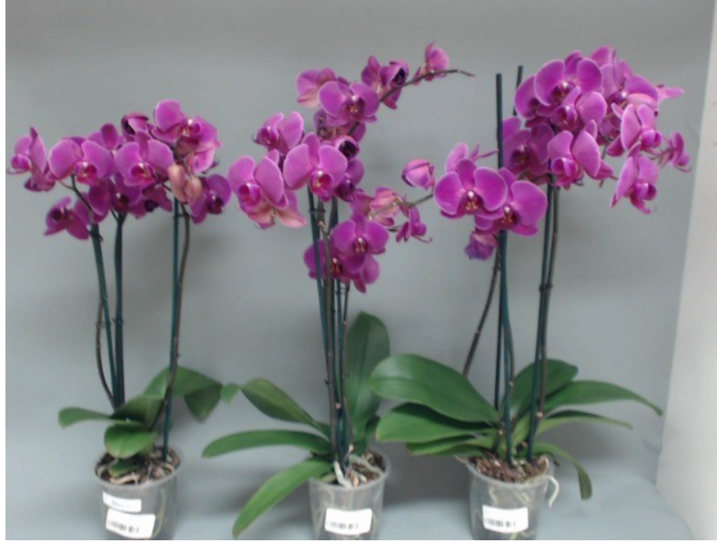
399. Consumer simulation day number 35