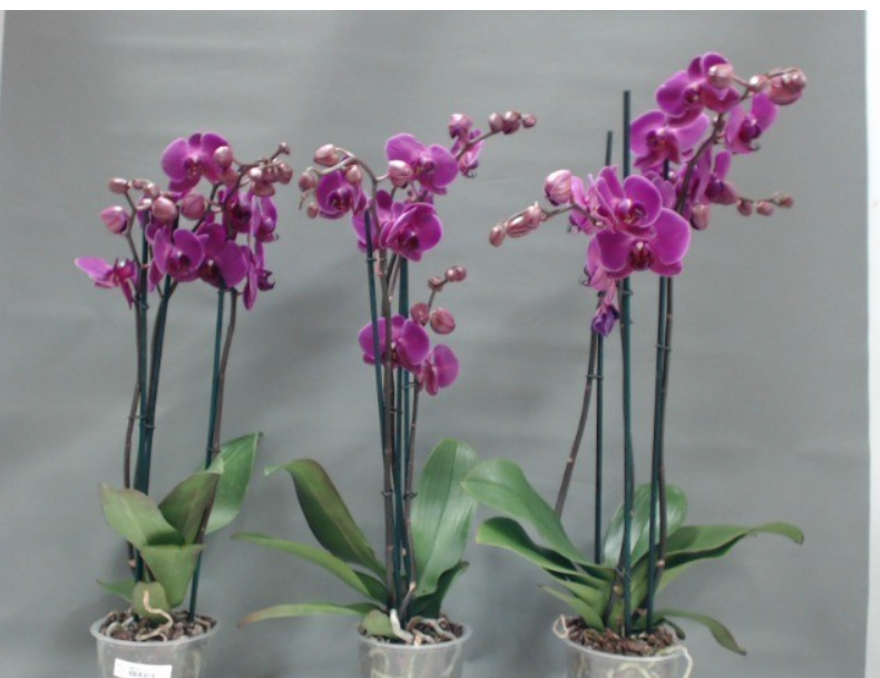
399. Consumer simulation day number 0