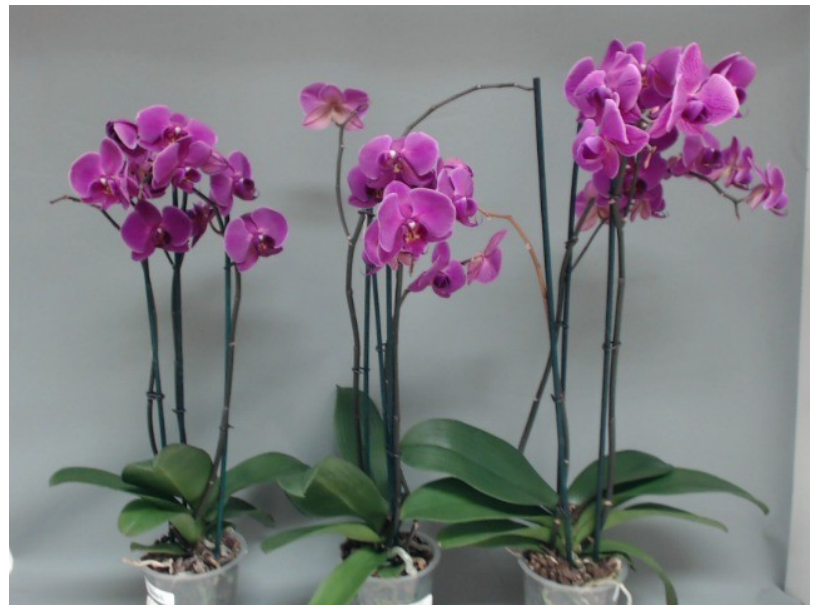
399. Consumer simulation day number 78