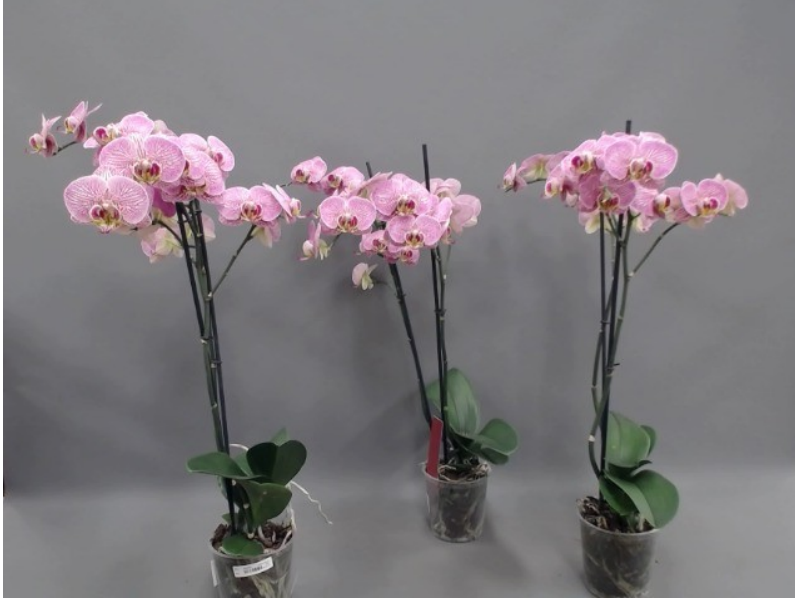
591. Consumer simulation day number 91