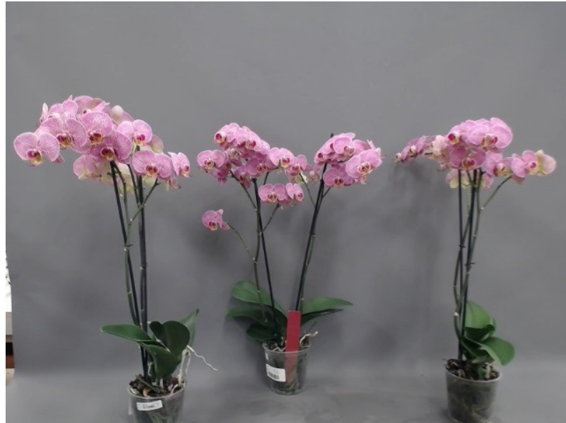
591. Consumer simulation day number 35