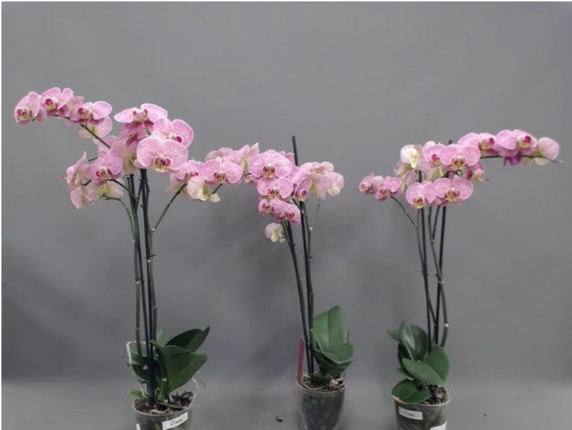
591. Consumer simulation day number 77