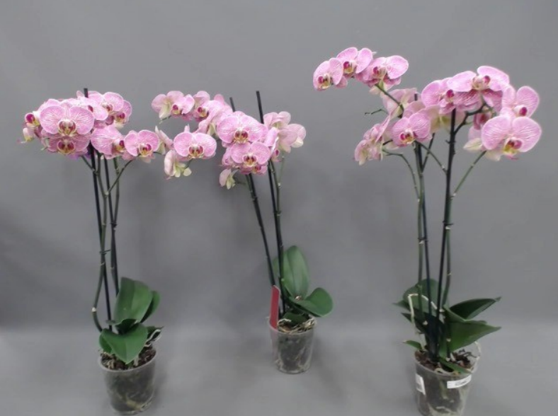
591. Consumer simulation day number 84