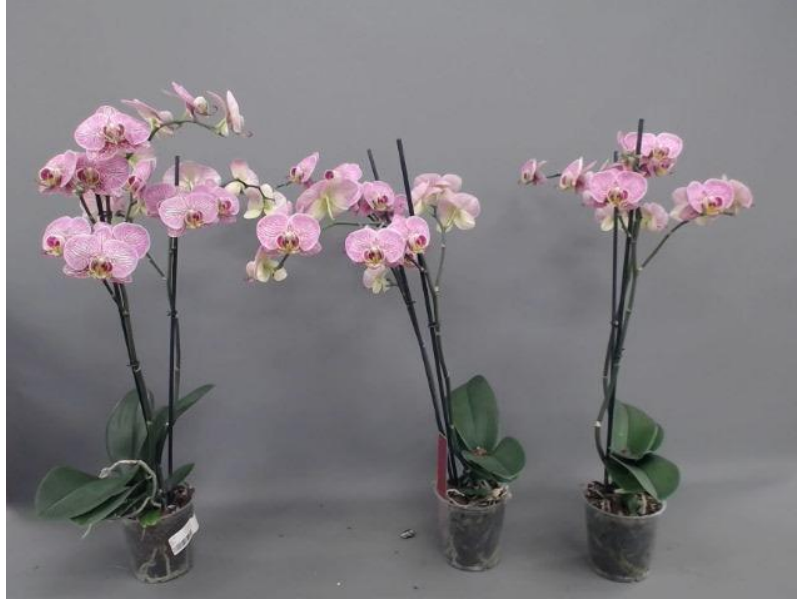
591. Consumer simulation day number 112