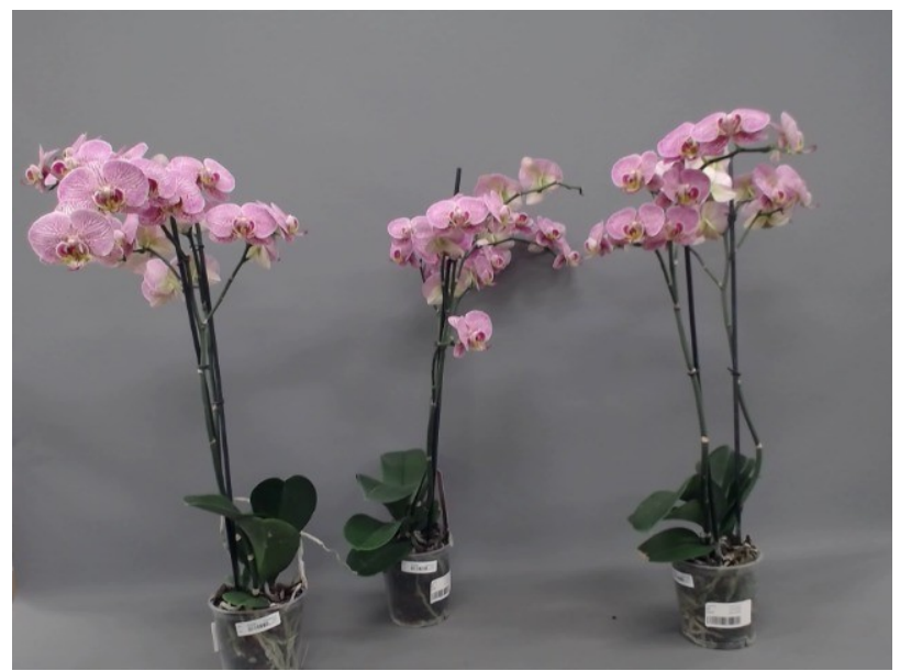
591. Consumer simulation day number 98