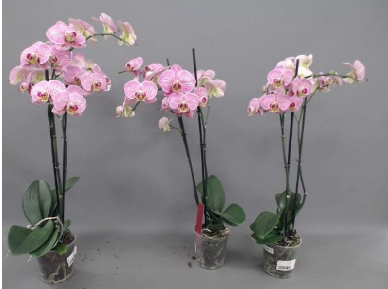
591. Consumer simulation day number 105