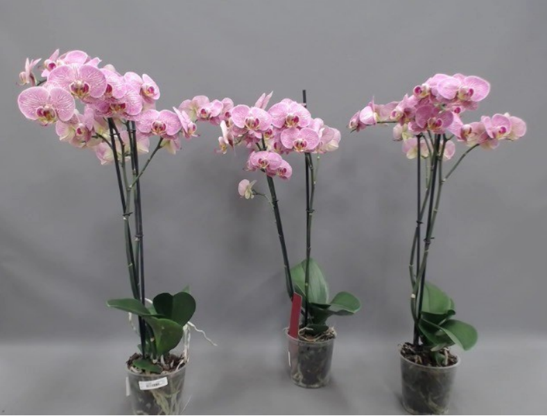
591. Consumer simulation day number 70