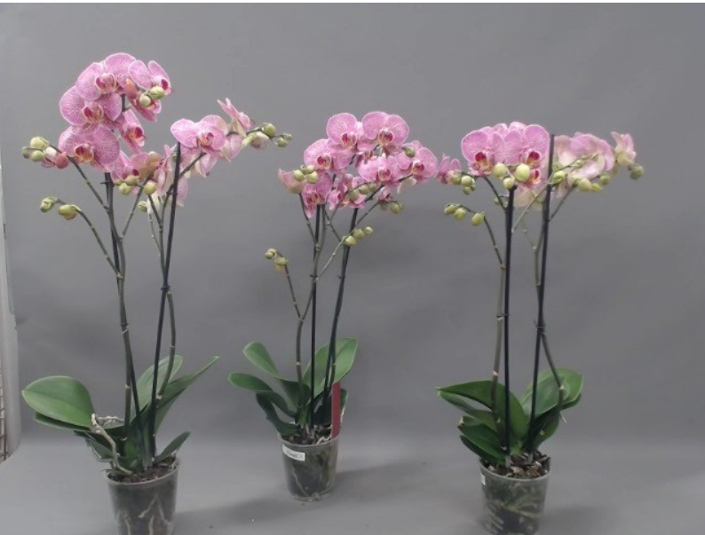
591. Consumer simulation day number 0