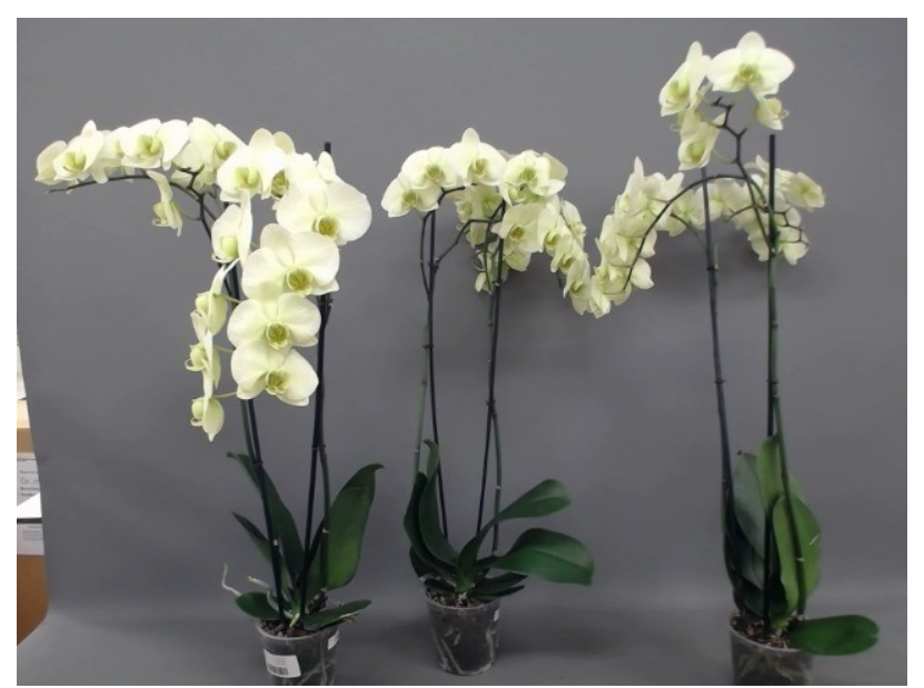
583. Consumer simulation day number 98