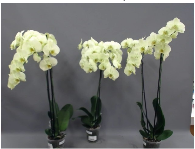
583. Consumer simulation day number 35