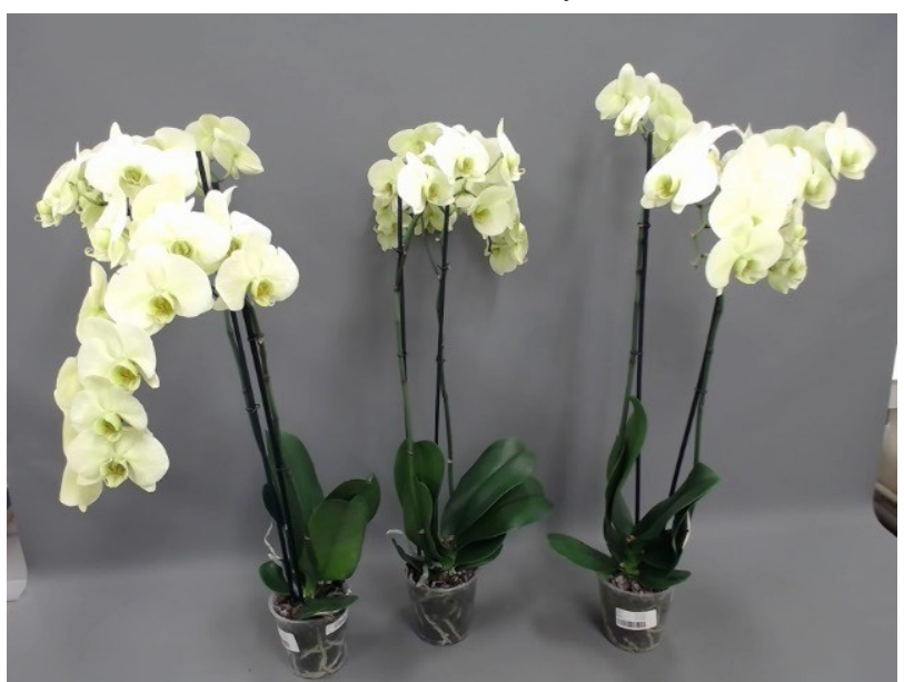
583. Consumer simulation day number 84