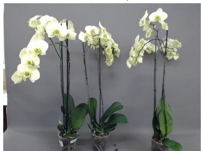
583. Consumer simulation day number 105