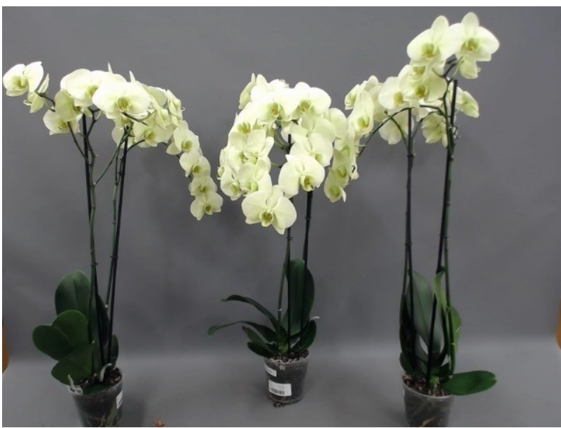
583. Consumer simulation day number 70