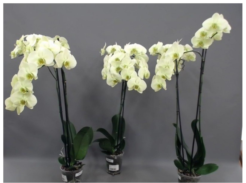
583. Consumer simulation day number 77