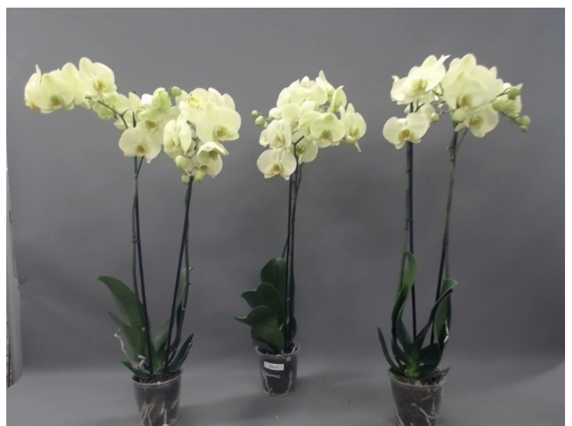
583. Consumer simulation day number 0