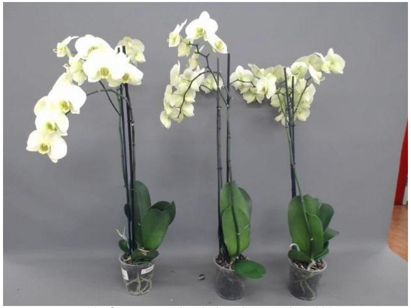
583. Consumer simulation day number 112