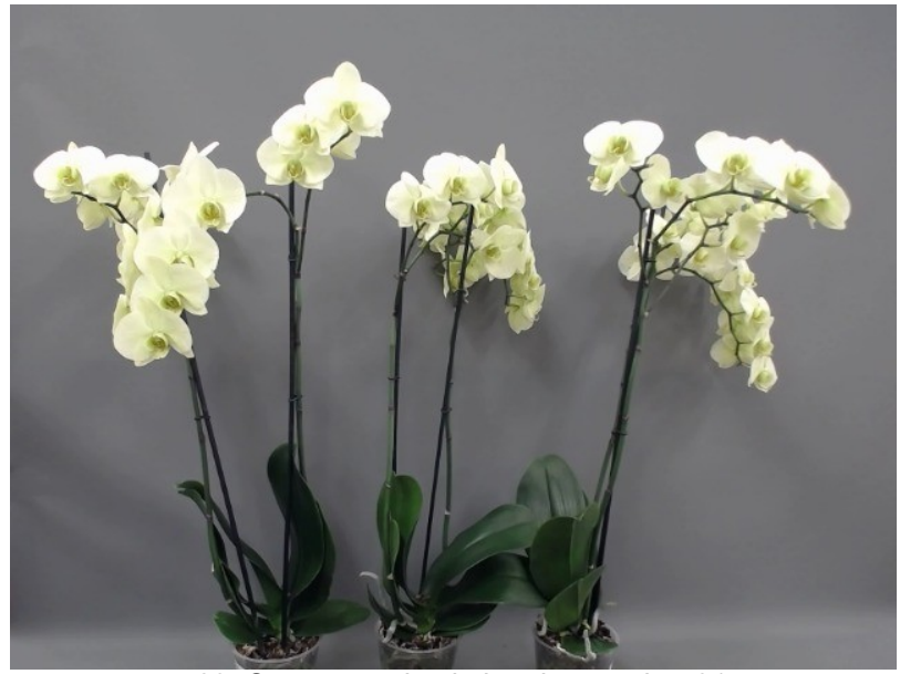
583. Consumer simulation day number 91